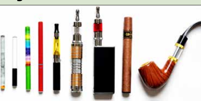
may purchase and obtain Vaping devices come in many sizes and styles, and often resemble pens, pipes or USB ports.

The illegal use of e-cigarettes among underage teens is a national public health concern. In 2017, Oregon became one of the first states to raise the minimum age, from 18 to 21, at which people tobacco products and inhalant delivery systems.