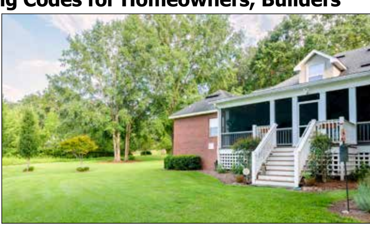
Modernized residential zoning codes should clarify City standards for modifications within Planned Development Residential Zones.

After extensive community conversation and research, the City adopted the Residential Neighborhood (RN) Zone for the Frog Pond area in 2017. RN Zone rules blended the City's best rules from then-existing residential zones with rules considered the most current and effective by professionals in the field. These rules are Wilsonville's most modern residen-