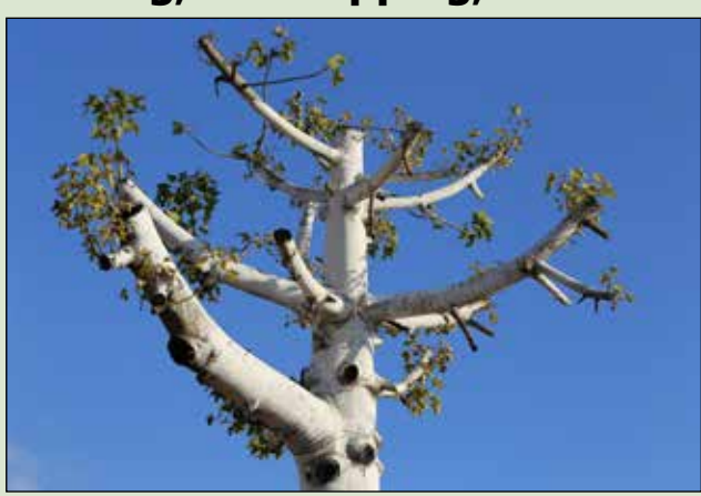
Topping trees can severely damage trees and make them more prone to disease or an infestation of insects.

As spring gardening begins, remember to treat your trees well. Often, trees are deprived of the care they need, or subjected to unhealthy pruning techniques.