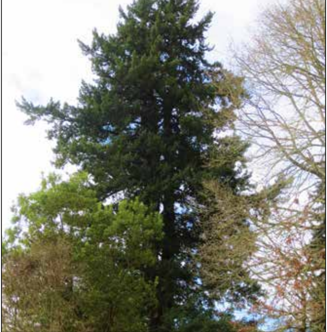
The R.V. Short Douglas Fir was designated a Wilsonville Heritage Tree in 2006.

An estimated 250-300 years old, the tree absorbed a lightning strike during the 1962 Columbus Day storm. The City installed two lightning rods to help protect it from future strikes, and provides regular pruning to