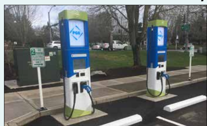
The City and PGE have increased the region's charging infrastructure with a six-car charging station at the Library.

Transportation is the largest source of carbon emissions in Oregon. The Electric Avenue network is powered by 100% renewable energy, advancing the City's sustainability goals and demonstrating PGE's commitment to a clean energy future.