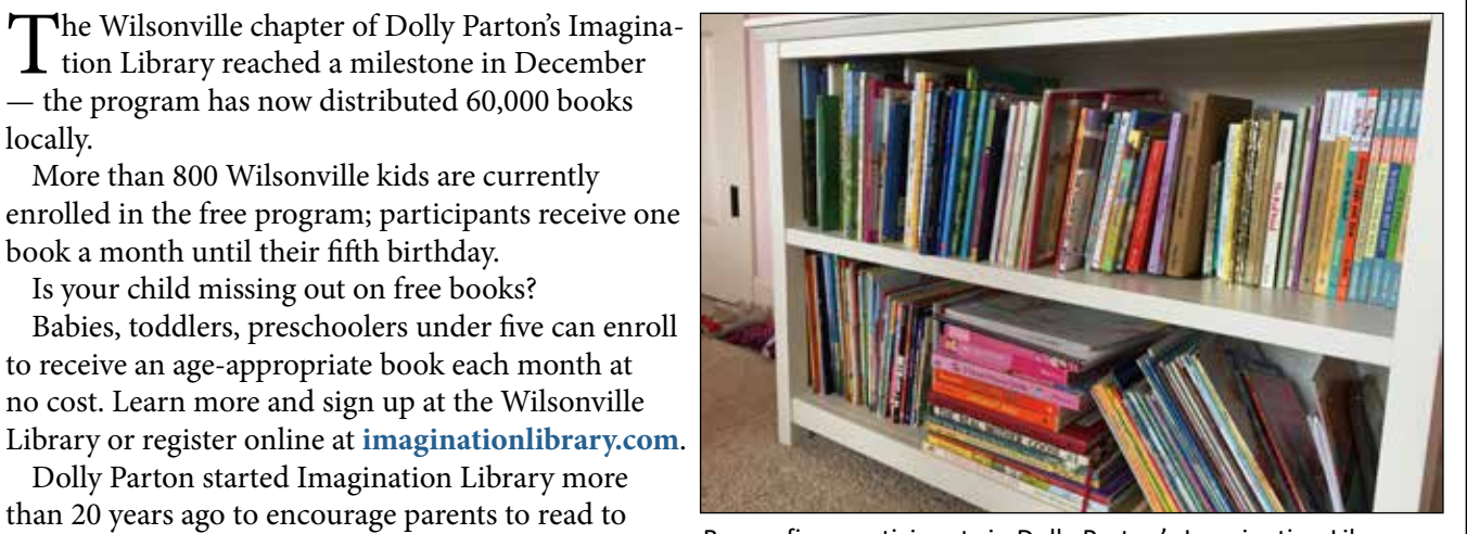
By age five, participants in Dolly Parton's Imagination Library have amassed as many as 60 free books.

The Imagination Library provides parents with the tools they need to make their children more successful