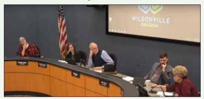
At the Feb. 3 meeting, Councilors discussed the potential impacts of a term-limit measure that will appear on the May 2020 ballot.

The Council unanimously backed an ordinance to include a neutral explanatory statement about the ballot measure in the voters' pamphlet, and chose not to draft a competing ballot measure, as allowed by