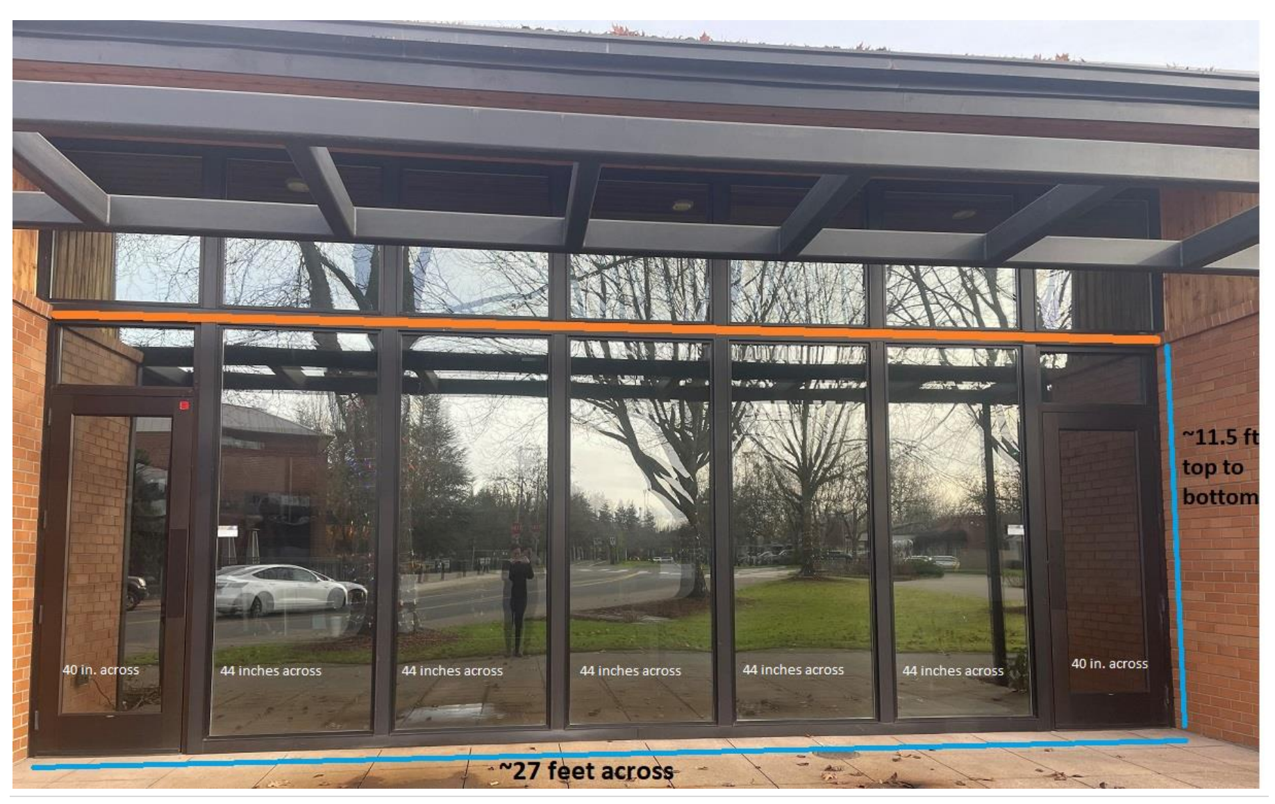
Image of Site. Mural will be on area UNDER the orange line. Windows are found at the Parks & Recreation Admin. Building 29600 Park Pl. Painting on exterior outside glass ONLY (no painting on black framing). Approx 310 Sq Ft. Measurements are not exact.