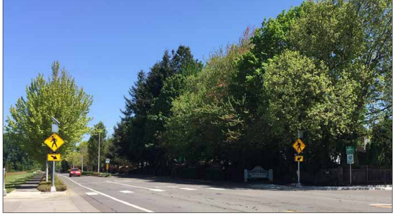
City Engineering staff recently used Community Enhancement funding to complete the Willamette Way/Graham Oaks Pedestrian Improvement project. New proposals are being sought for consideration during the upcoming funding cycle.