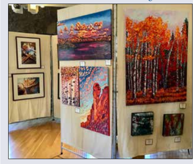
A Community Opportunity Grant is funding the purchase of new gallery displays for the Charbonneau Arts Festival.

WilsonvilleParksandRec.com/GrantPrograms/.