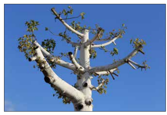
Topping trees can severely damage trees and make them more prone to disease or an infestation of insects.

As spring gardening begins, remember to treat your trees well. Often, trees are deprived of the care they need, or subjected to unhealthy pruning techniques.