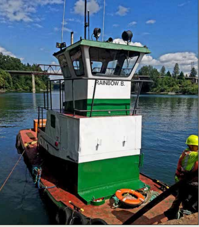
Operators of tugboats, like Rainbow B , used the City's cable trees to tie down log rafts awaiting delivery to Oregon's mills.

Most logs were moved manually, using long pike