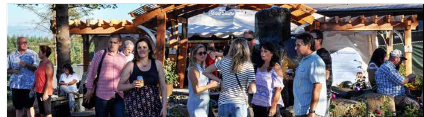
A dining bistro is a hallmark of the annual NW Natural Street of Dreams event, coming to Wilsonville this summer.

The NW Natural Street of Dreams<sup>®</sup> is coming to ▲ Wilsonville this summer, July 27-Aug. 25. Stafford Meadows, the first neighborhood to be developed at Frog Pond West, has been selected as the site for the 44th annual luxury-home showcase, presented by the Home Builders of Metro Portland.