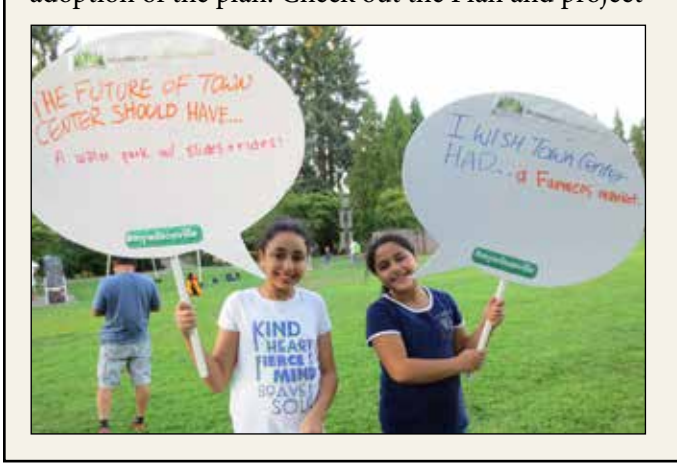
photo gallery at the Town Center Plan Showcase at City Hall, 5-6 pm, before the meeting.

On March 13, at 6 pm at City Hall, the Planning Commission is holding a public hearing to consider adoption of the plan. Check out the Plan and project