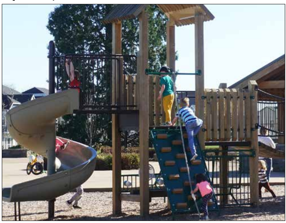
Edelweiss Park in Villebois is one of five completed parks along the Villebois Greenway. Three new parks are about to be constructed, more than doubling the size of the greenway and providing new amenities.

At the Village Center, the City's economic development staff is working to incentivize mixed-use development by considering a Vertical Housing Develop-