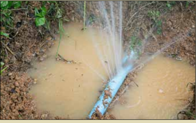
residents inspect irrigation systems before regular use. Early