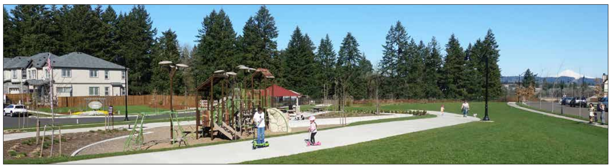
Trocadero Park in Villebois provides a view of Mount Hood among other amenities, including a play area, park shelter and skate park. The park is getting a new tennis court during an upcoming project to complete the remaining 18 acres of the community's 33-acre linear park along the regional Ice Age Tonquin Trail.