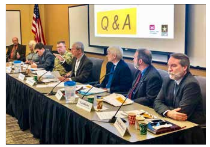
Watch the Willamette River basin watershed presentation online: youtube.com/watch?v=ZSEvfTSiOw0

In February, the City of Wilsonville hosted Congressman Kurt Schrader on behalf of the Oregon Congressional Delegation for a presentation on issues pertaining to the Willamette River basin watershed.