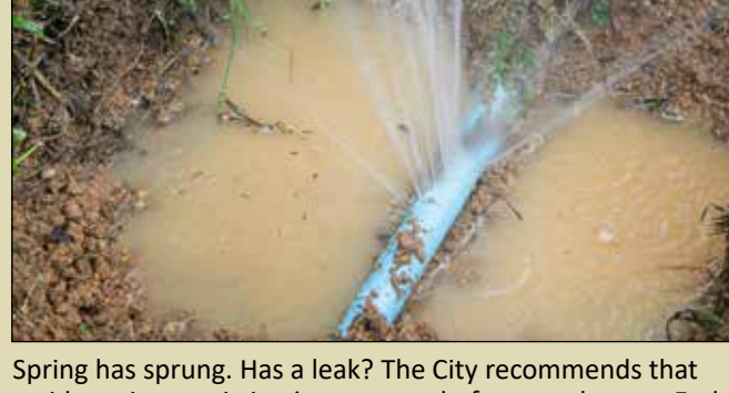
water usage is charged at a detection can lower water usage charges.

For information on billing, meters, rates, payment options and leak detection, visit ci.wilsonville.or.us/ UtilityPayment or call 503-570-1610.