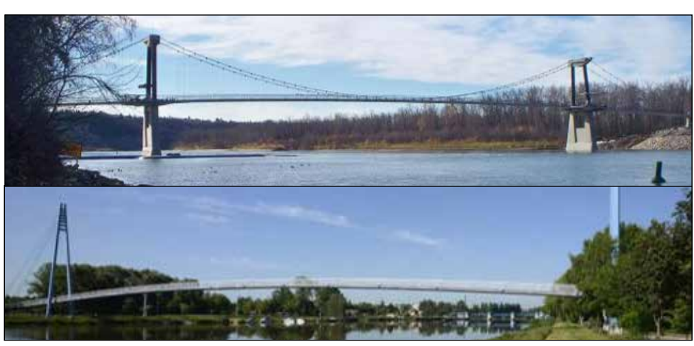
Community members are invited to weigh in with their preference for a suspension bridge (top) or cable stay bridge (bottom). The two bridge types were recommended by the French Prairie Bridge Task Force and City Council for further consideration.

Learn more at FrenchPrairieBridgeProject.org or contact Project Manager Zach Weigel at 503-570-1565; weigel@ci.wilsonville.or.us.