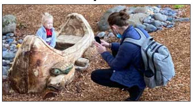
The nature play area at Memorial Park is among the recent City projects developed with funding from the Wilsonville-Metro Community Enhancement Program.

The City is looking for new community projects to receive funding through the Wilsonville-Metro Community Enhancement Program.