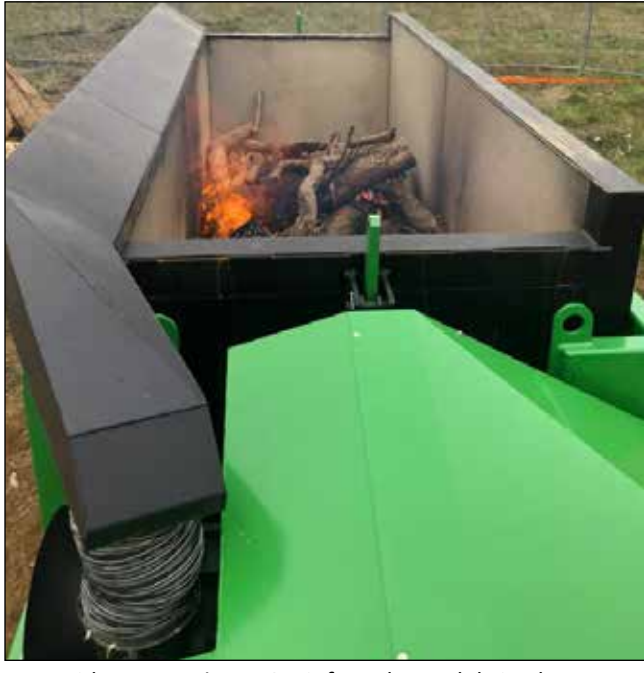
To avoid transporting MOB-infested tree debris, the Department of Agriculture brought an industrial incinerator to Wilsonville to burn infested wood.

Mediterranean Oak Borer is a serious and emerging threat to Oregon white oaks and other tree varieties. The pest is thought to thrive in trees already stressed by drought.