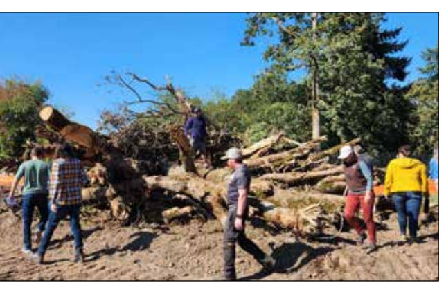
An infested tree in Frog Pond West was the first to be taken down because of decline as a result of Mediterranean Oak Borer, an emerging threat to Oregon oak trees.

City planners and consulting arborists have been collaborating with the ODA and the Oregon Department of Forestry since this summer, when suspicion of