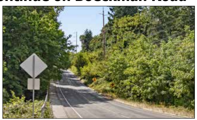
The segment of Boeckman Road that includes the "Boeckman Dip," east of Canyon Creek Road, is soon being closed to through traffic for up to a year.

Roadway improvements have been designed to provide safer, more accessible transportation infrastructure for all modes of transportation. These in-