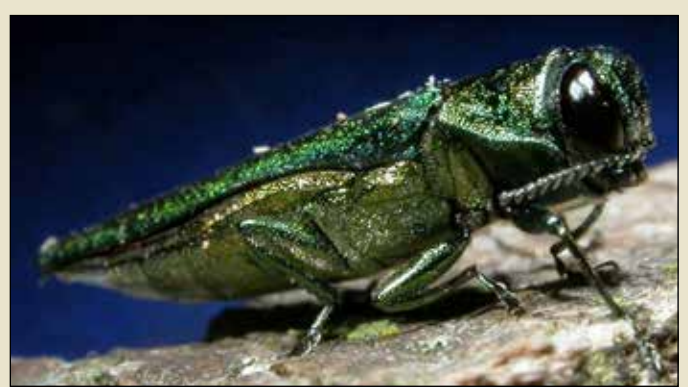
Though only a half-inch in length, the Emerald Ash Borer is wreaking mass devastation on the world's ash trees. The pest was first discovered in Oregon this summer.