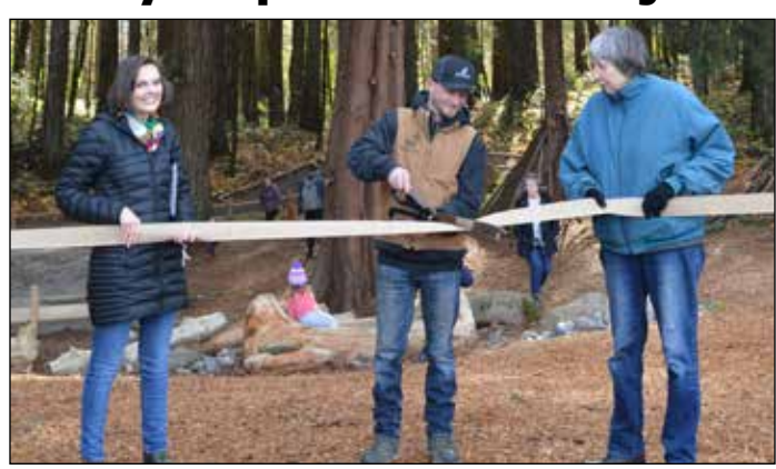
The award-winning nature play area at Memorial Park is among the recent projects developed with funding from the Wilsonville-Metro Community Enhancement Program.

Applications must be received by Jan. 14. There are two application workshops on Nov. 30 (noon, 6 pm) to discuss project ideas and the application process.