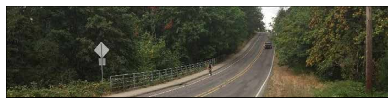
The portion of roadway that includes the "Boeckman Dip" is undergoing several improvements, including a bridge to flatten the curve and provide a throughway for wildlife. The upgraded road will include dedicated bike and pedestrian lanes.

For more information and/or to received monthly construction updates visit ourreliablewater.org .