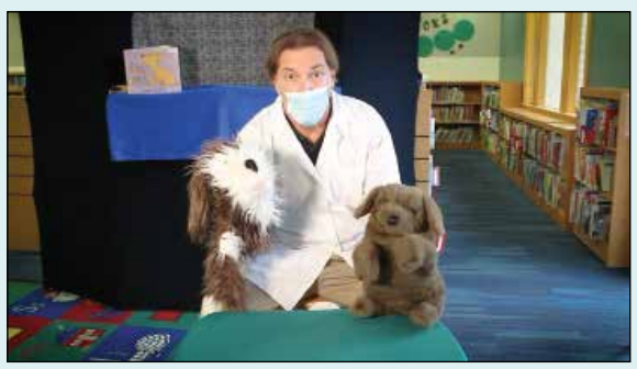
Storytime LIVE Live interactive videos on Thursdays at 10:30 am on YouTube and Zoom WilsonvilleLibrary.org/storytime