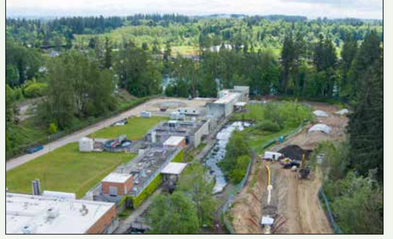
Installing water pipeline at the Willamette River Water Treatment Plant is requiring the temporary closure of the adjacent park this summer.

Restoration of the park and trails will begin once the current phase of construction is complete.