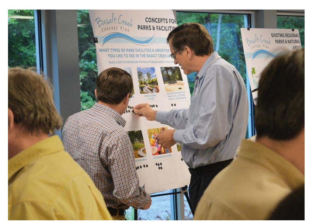
Consultants and staff from the cities of Wilsonville and Tualatin collected feedback from citizens on development of the Basalt Creek area at an open house April 28.

Concept plan expected to wrap up this year