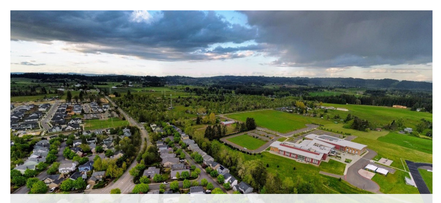
Frog Pond East and South, looking northeast, with SW Wilsonville Road and existing neighborhoods in the left side of the photo.