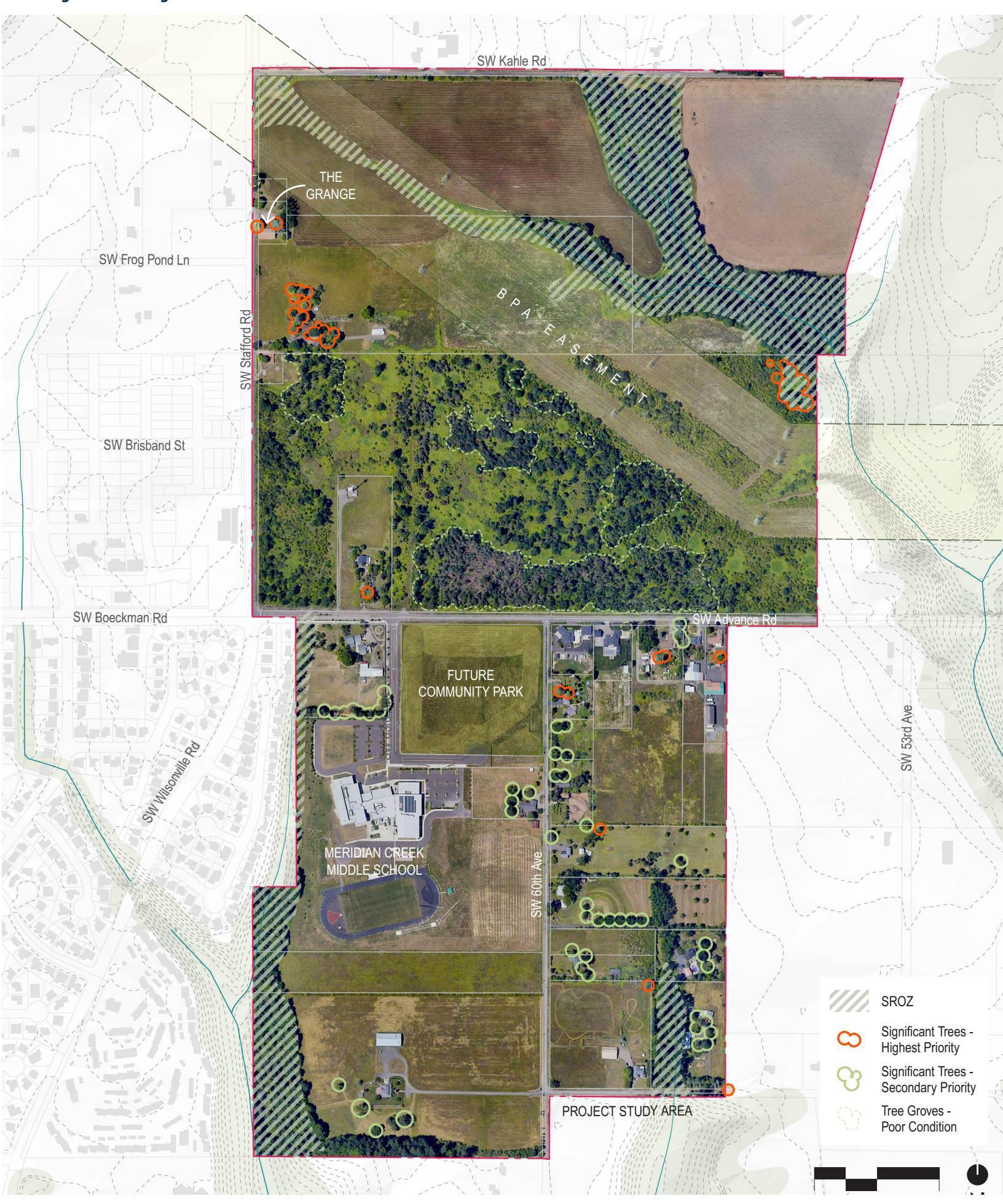
Figure 5. Existing Conditions

DECEMBER 19 2022 FROG POND EAST & SOUTH MASTER PLAN 23