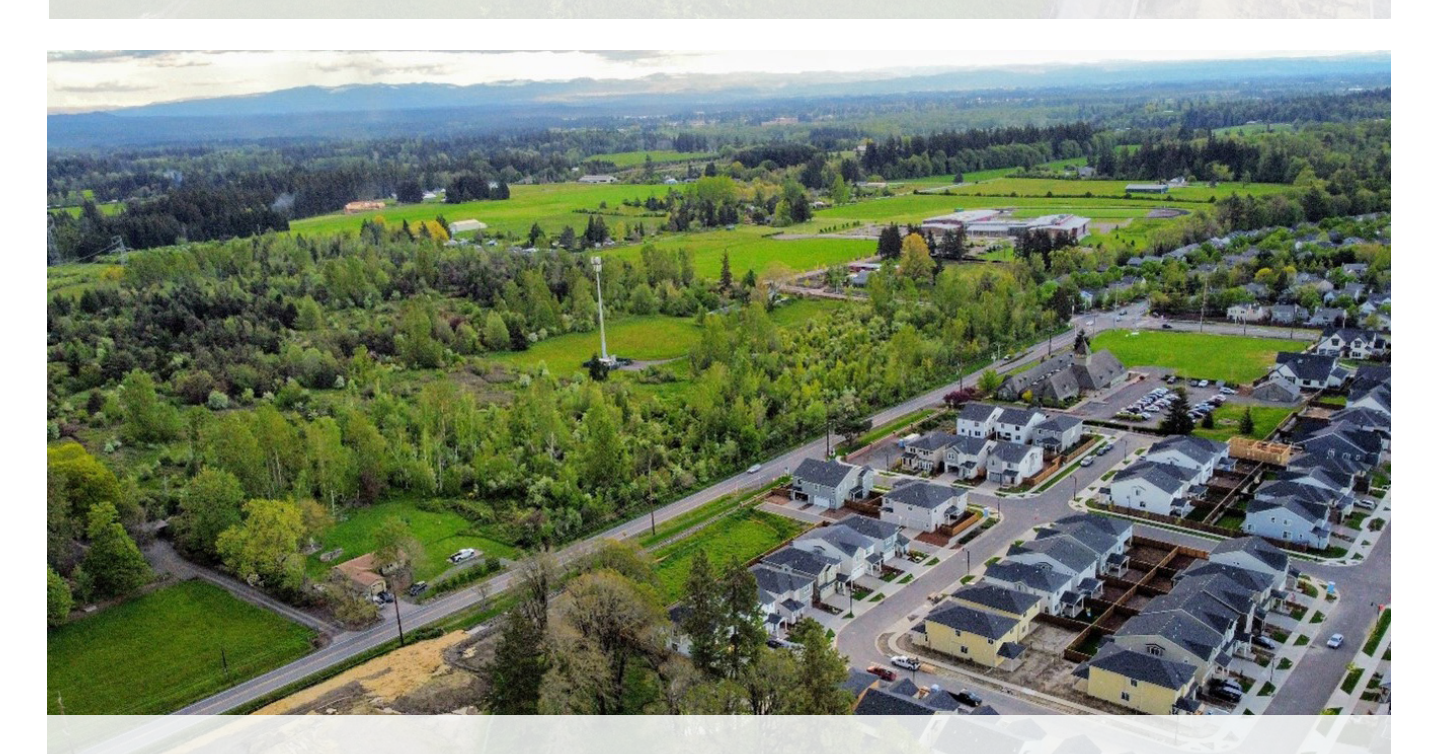
Frog Pond East and South, looking southeast. New development in Frog Pond West is visible in the foreground and Meridian Creek Middle School is to the south.

DECEMBER 19 2022 FROG POND EAST & SOUTH MASTER PLAN 21