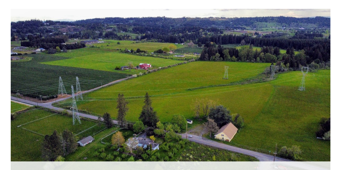
The northern portion of Frog Pond East, looking northeast. The Grange is visible in the foreground with the BPA easement and Kahle Road to the northeast.