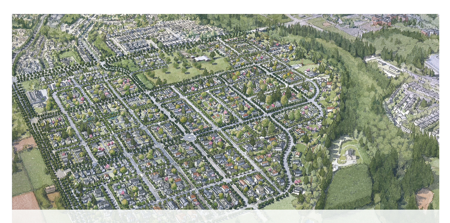
Frog Pond West artist's rendering, looking Southwest.

Meridian Creek Middle School and Future Community Park. The middle school property was the first Frog Pond land to annex and develop after inclusion in the Urban Growth Boundary in 2013. The 10-acre future community park site is also annexed. These existing and future community uses will be important civic uses within the Frog Pond South neighborhood.