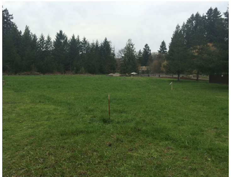
Site of the proposed parking lot, adjacent to the existing Community Garden.