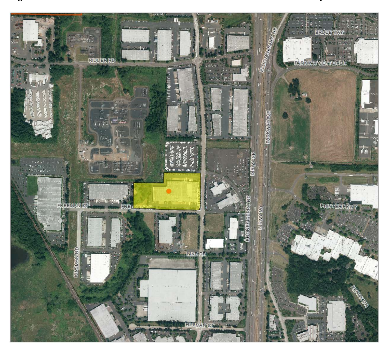
Figure 1 – 26755 SW 95th Avenue Urban Renewal Plan Area Boundary