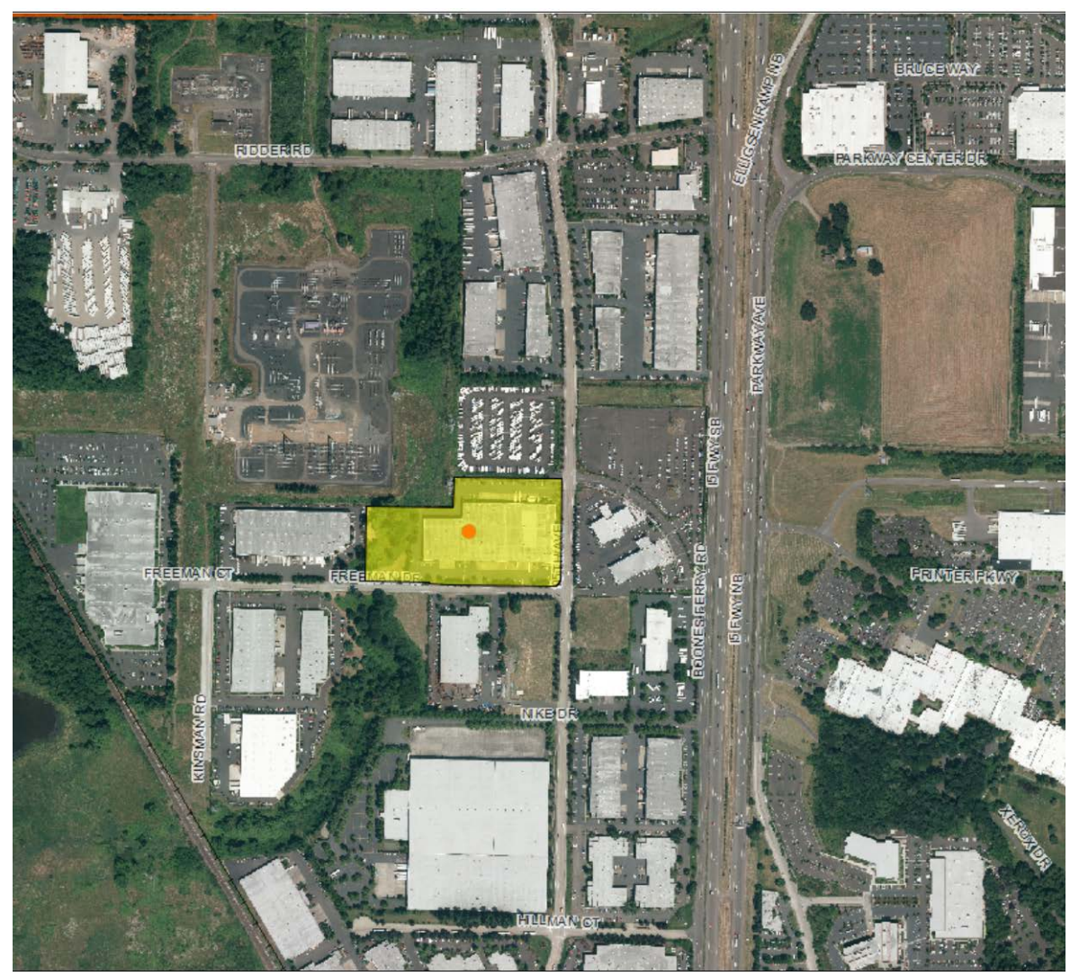
Figure 1 – 26755 SW 95<sup>th</sup> Avenue Urban Renewal Area Boundary