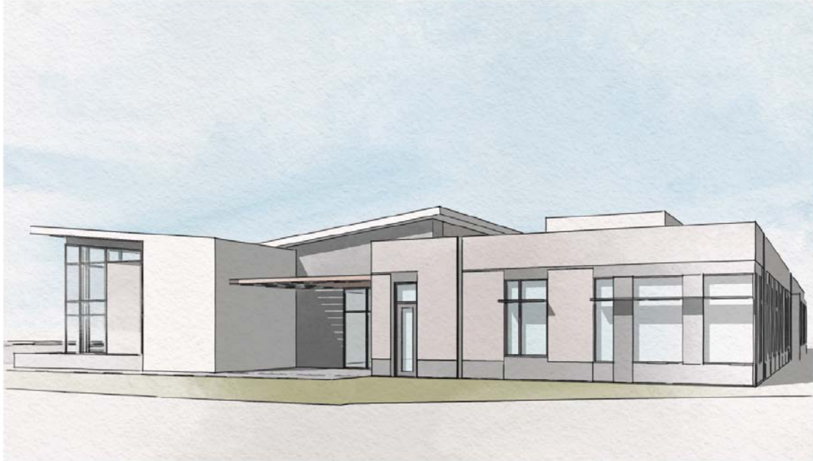
Northeast Corner View – Perspective B