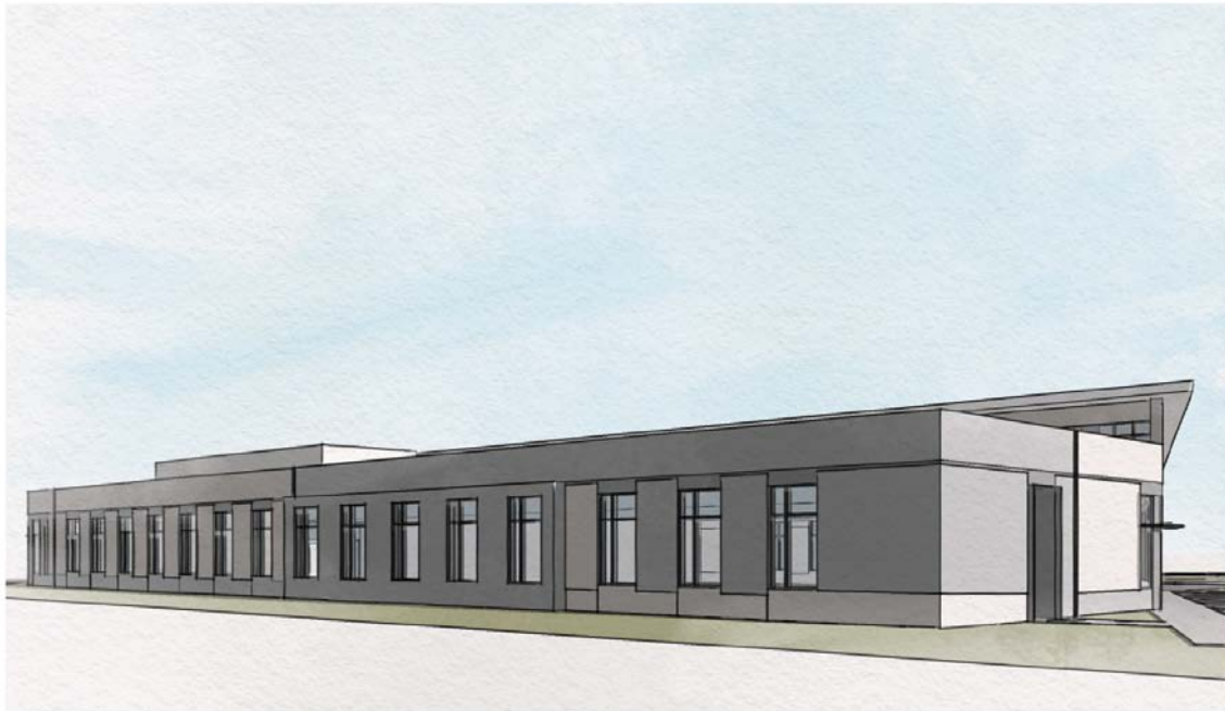
Northwest Corner View – Perspective C