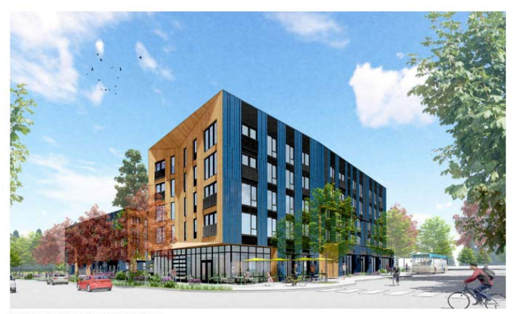
VIEW FROM SOUTHEAST CORNER