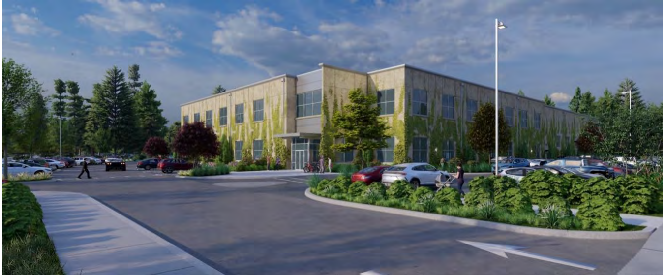
The proposed W5 hi-tech industrial building “shell” in morning light off SW Boeckman Road.