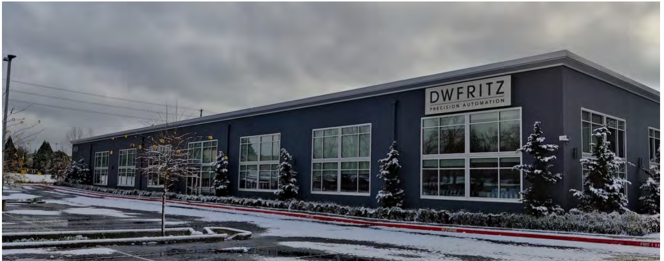
W4 building facade and window pattern from SW Boeckman Road after the 2016 renovation for DWFRITZ Precision Automation, a hi-tech industrial user. Palette is concrete walls painted a dark neutral grey. The large window openings in this north facing facade are clear anodized aluminum as is the coping. Shell architect is LMA.