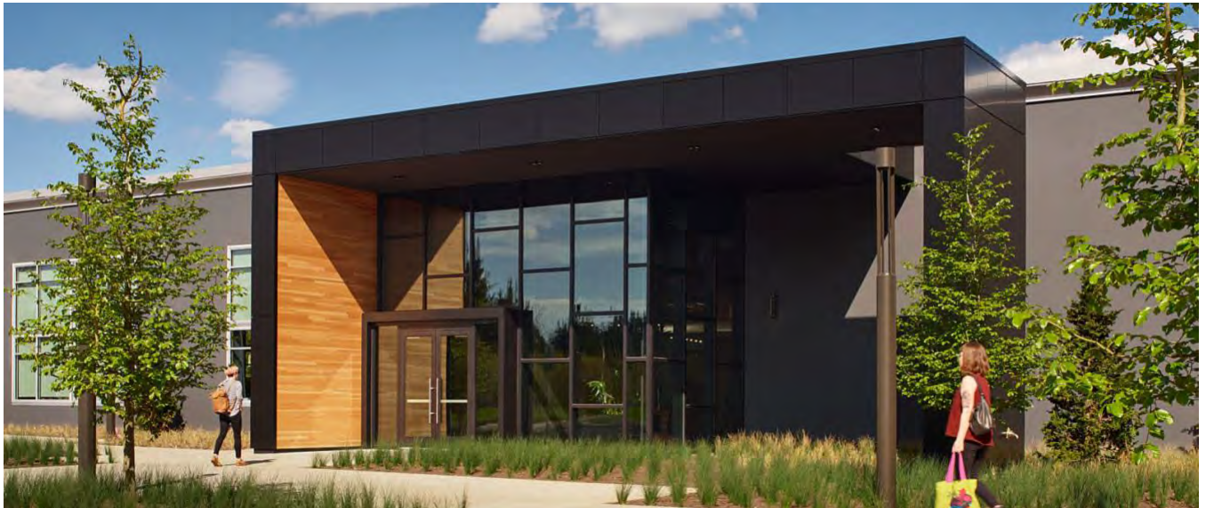
W4 lobby addition for DWFRITZ Precision Automation faces the proposed W5. Interior & lobby architecture by Hacker.