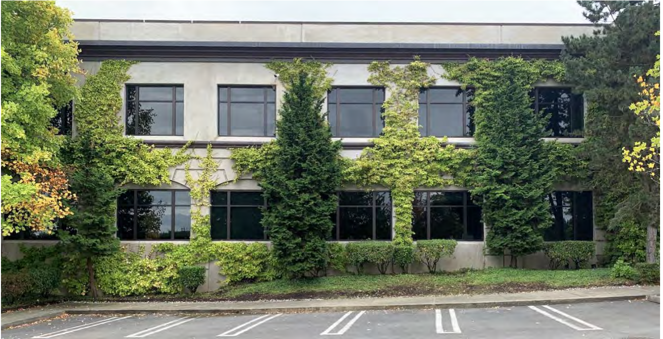
A 2021 image of another development by the owners in Bellevue, WA from 1998 that has a similar limited exterior material palette same as proposed in W5. This older office building weathers very well with stained precast walls that still repel water intrusion and hold up well to the three-decades-old vines naturally attached. The facade is heavily rusticated with deep- set windows in 12" concrete walls, bronze metal bands, and deep concrete reveals . Shell architect is LMA.