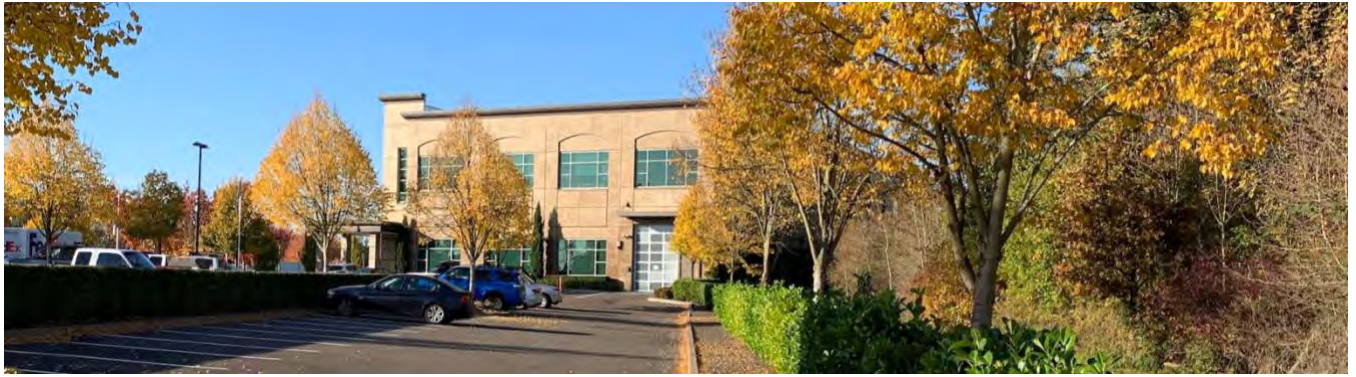
W3 in Wilsonville from 2012 is part of the complex that includes W1 and W2 and borders the SROZ on right. Originally expansion space for DWFRITZ, it is now occupied by Sig Sauer, Electro-Optics. Shell architect is LMA.