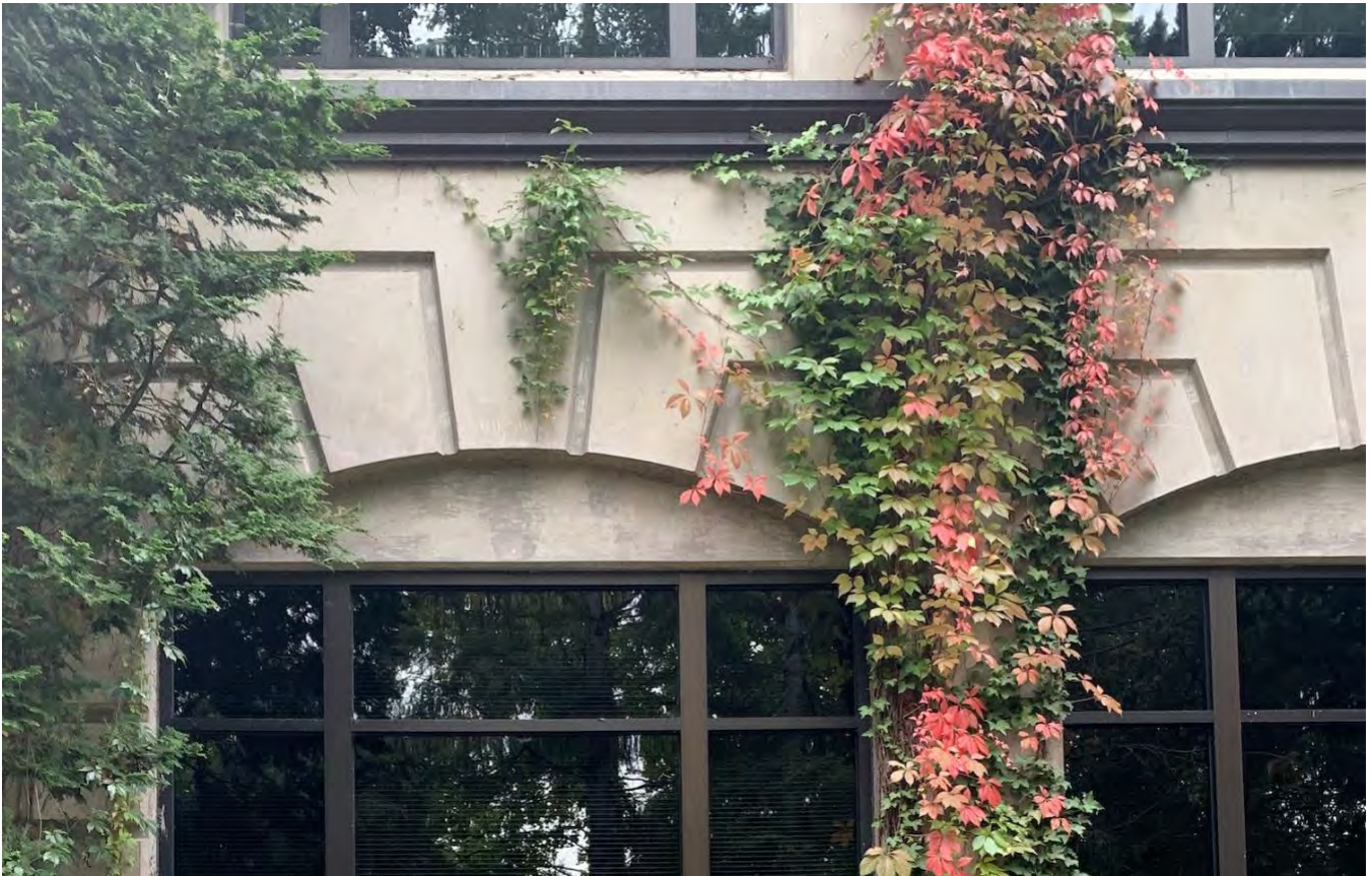
A close-up of the previous building better showing the nicely patinaed stained pre-cast concrete vines and rustication.