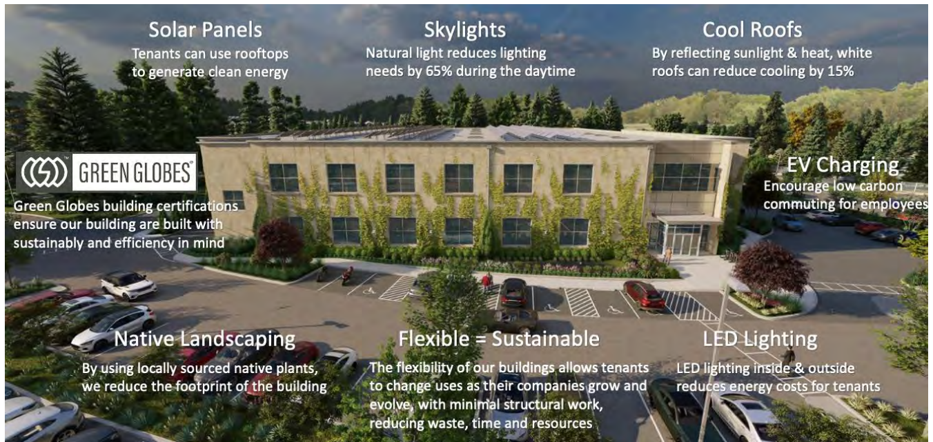
W5 marketing image (east elevation) highlighting sustainable and flexible features.

Because the W5 owners are not certain who they are designing this hi-tech industrial building shell for when beginning the permit process, they build in flexibility and sustainability. This is important short-term for the first tenant and for long-term ownership to secure future tenants. W5 examples include: