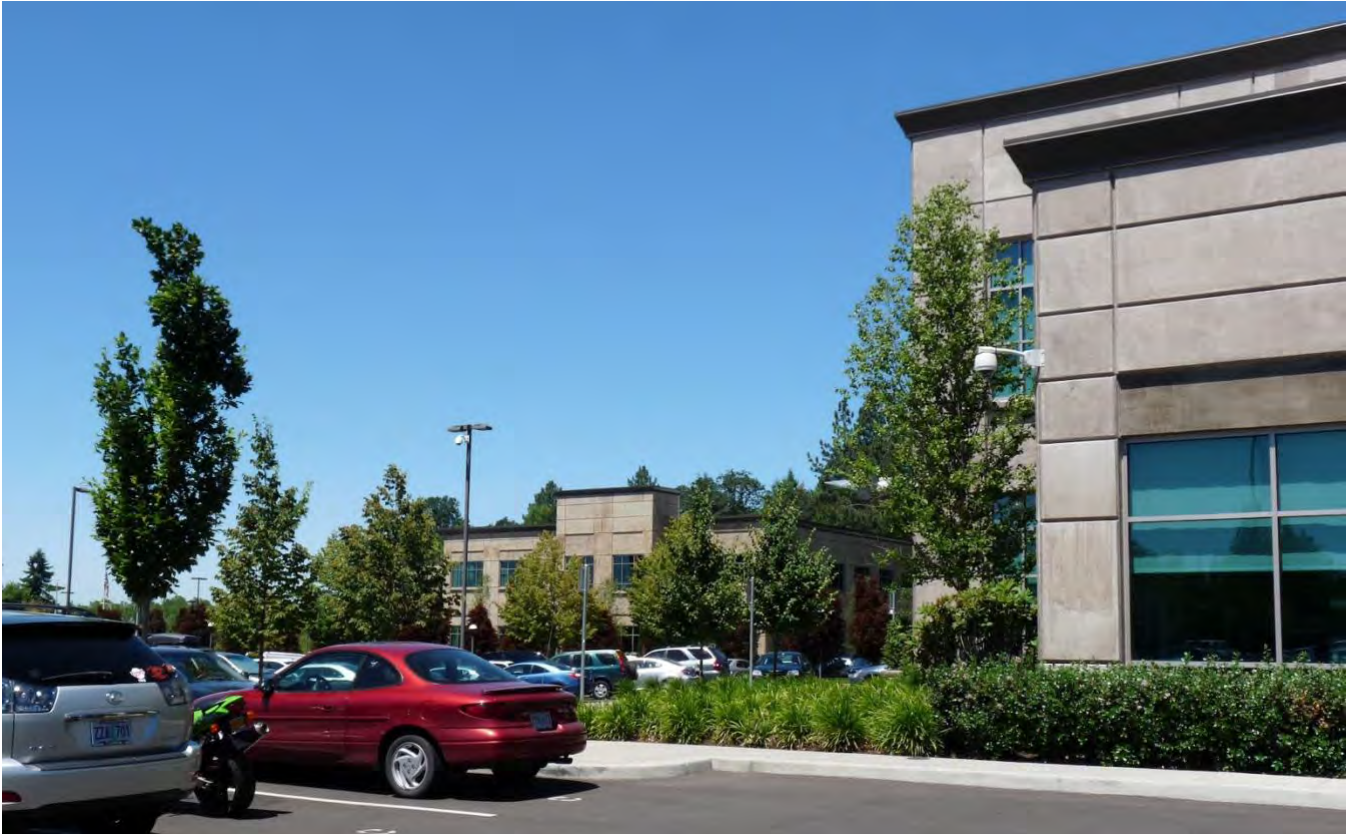
W2 in Wilsonville from 2006 in foreground with W1 beyond on left. The simple palette is stained precast concrete walls with deep facade rustication and deeply set windows. Extensive large ornamental landscaping adds to the significant preserved SROZ natural areas, same as proposed in W5. Shell architecture by LMA.