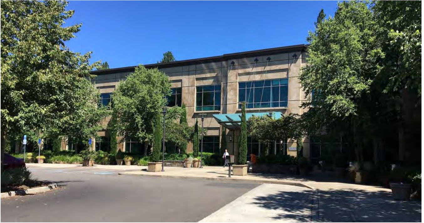
W1 in Wilsonville from 2009 at the front entry showing the simple palette of stained precast concrete walls, deep facade rustication with deeply set windows and extensive ornamental landscaping in addition to the preserved natural areas. Shell architecture by Lance Mueller & Associates (LMA).