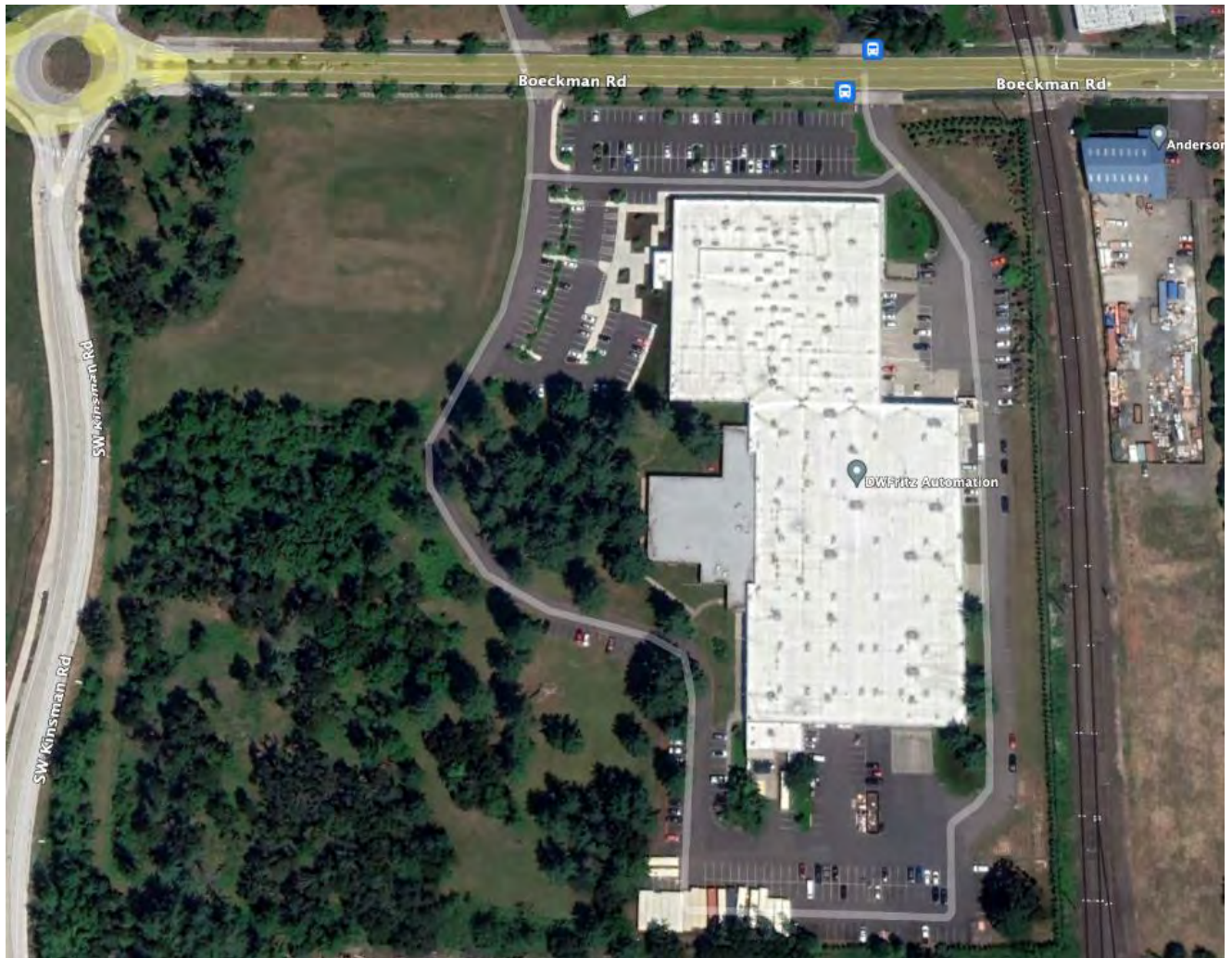
Site aerial view after the DWFRITZ Precision Automation (W4) renovation and completion of SW Kinsman Road bordering the east property line. W5 is proposed on the only undeveloped treeless area left on the 24.5-acre lot.