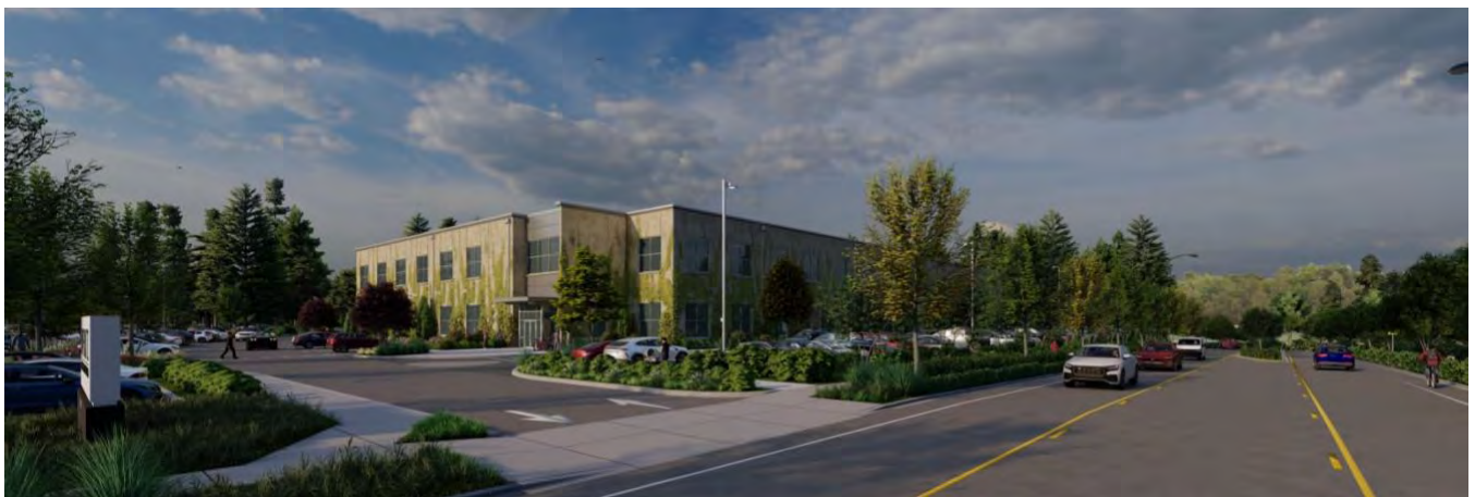
Before and after images from SW Boeckman Road looking SW at the existing drive entry to remain. W5 is located on the natural grass area, and most of the existing trees on this 24.49-acre site remain. Street trees are well established.