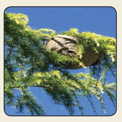
Removed large hornets nets from tree in Courtside Park