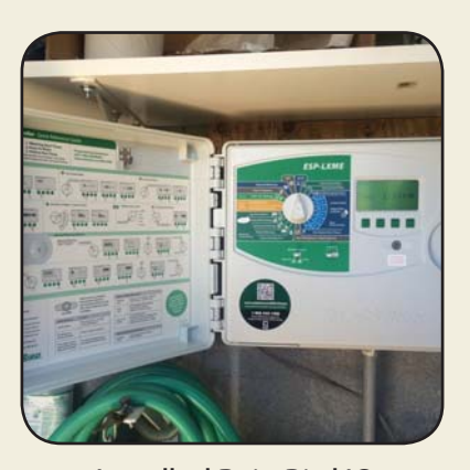
Installed Rain Bird IQ controllers at 5 City parks