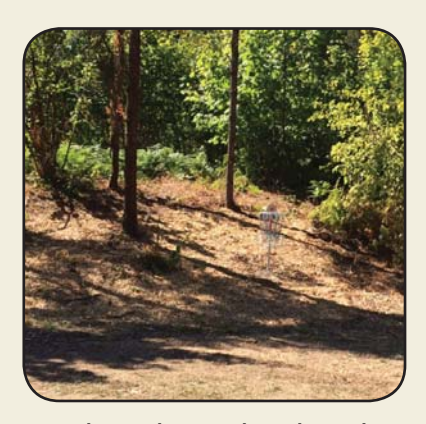
Cleared more brush and poison oak from disc golf course