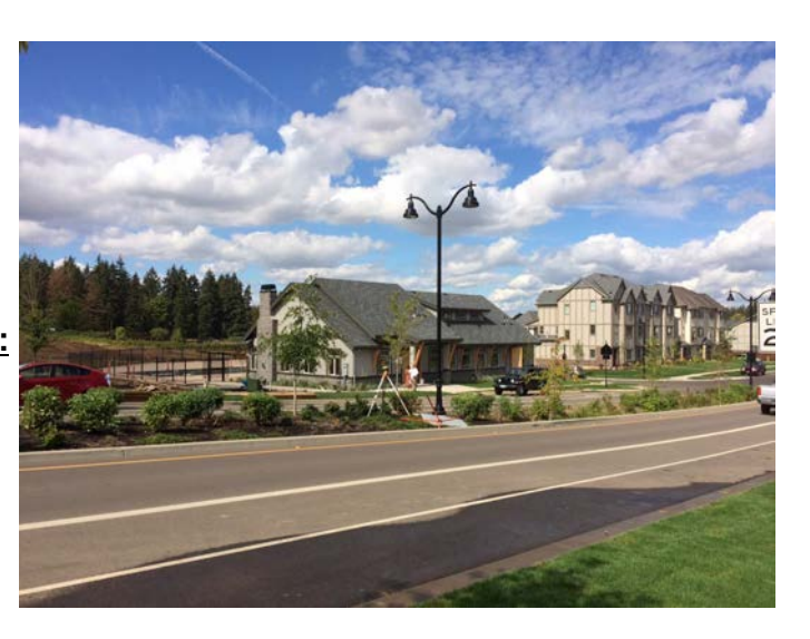
Villebois Swim Center