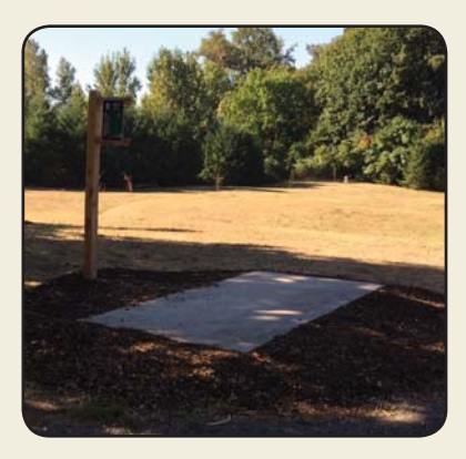
Installed Engineered Wood Chips around tee pads at disc golf course