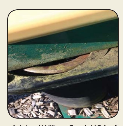
Advised Willow Creek HOA of hazard teeter totter and assisted with removal