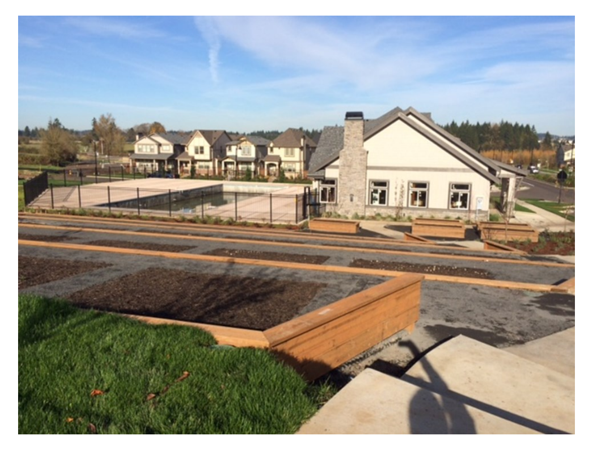
Villebois neighborhood community center, pool and community gardens