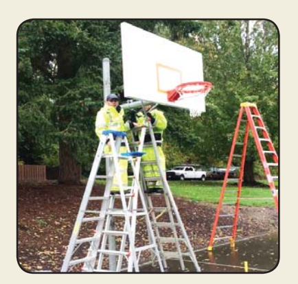
Installed new basketball backboard and rim at Boones Ferry Park