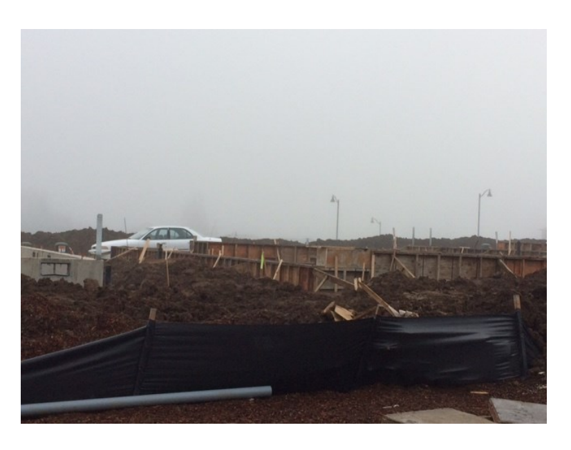
Tonquin Meadows 3