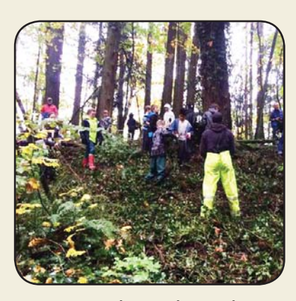
Hosted 55 6th grade volunteers through SOLVE