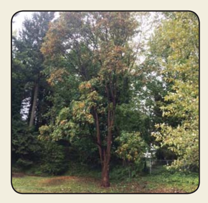
Pruned Big Leaf Maple at Duckworth Property future site of trail expansion