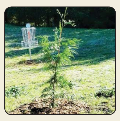
Planted 20 trees at Disc Golf Course