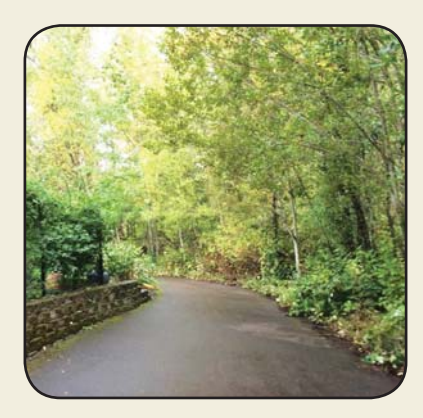
Pruned and cleared vegetation at Canyon Creek neighborhood trailhead

Recently Completed/Renewed* Certifications and Trainings: