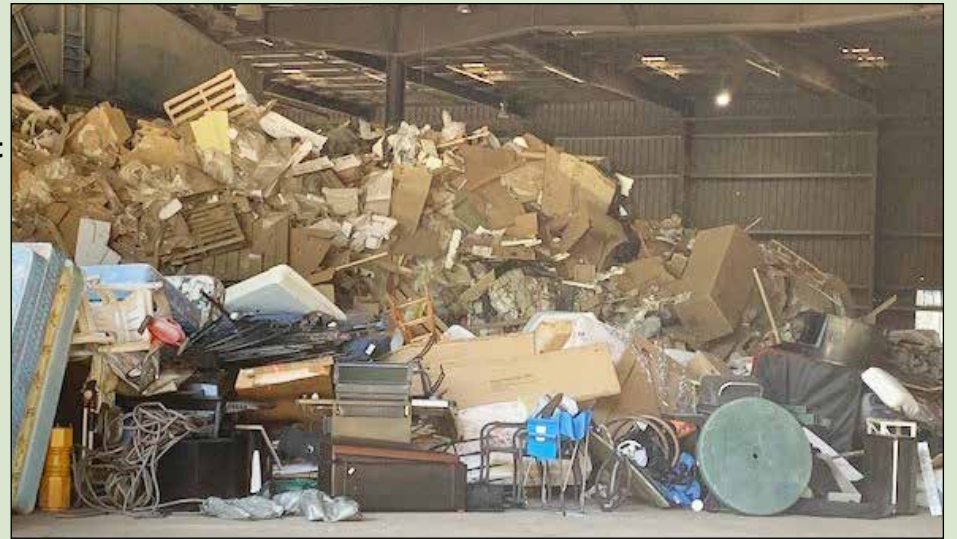
Republic Services took in nearly 54 tons of waste at May's Bulky Waste Day.