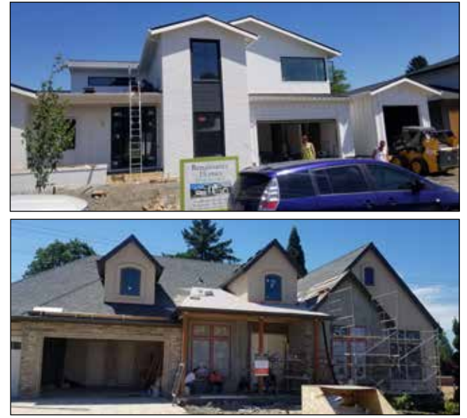
A look at two of the six Street of Dreams homes under construction in Stafford Meadows.

This year's featured homebuilders are demonstrating the latest in energy-efficiency. An Energy Performance Score is rating the environmental impacts and long-term energy savings of each home. Green building certifications are showcasing energy incentive programs available in Oregon and how they benefit homeowners and builders. Automation technology is also on display; visitors can see some of the best home automation systems on the market. The Portland Home Builders Association of Metro Portland produces the NW Natural Street of Dreams in partnership with the City and its sponsors. Promotional support is provided by several local entities supporting "Summer Fun in Wilsonville," including World of Speed, Portland Parent Magazine, Wilsonville Rotary Concert Series, Wilsonville Parks & Recreation's Movies in the Park and Explore Wilsonville. Wilsonville residents can use the "SUMMERFUN" promo code for a $3 discount on Street of Dreams tickets (up to 4). To purchase tickets or learn more about the event, visit StreetofDreamsPDX.com .