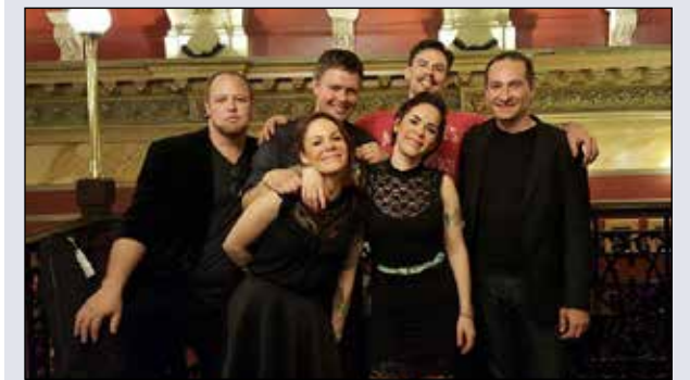
Dance Hall Days visits Wilsonville on Thursday, July 25, as part of the 2019 Wilsonville Rotary Concert Series.

For more information about the concerts and opening acts visit WilsonvilleConcerts.com .