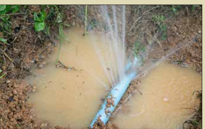
(Tier I) rate. Additional water usage is charged at a Spring has sprung. Has a leak? The City recommends that residents inspect irrigation systems before regular use. Early detection can lower water usage charges.

Wilsonville's tiered water rate structure encourages water conservation; higher rates are applied as consumption increases. From April to November, indoor seasonal water usage plus three additional units are billed at the base (Tier I) rate. Additional water usage is charged at a higher irrigation (Tier II) rate.