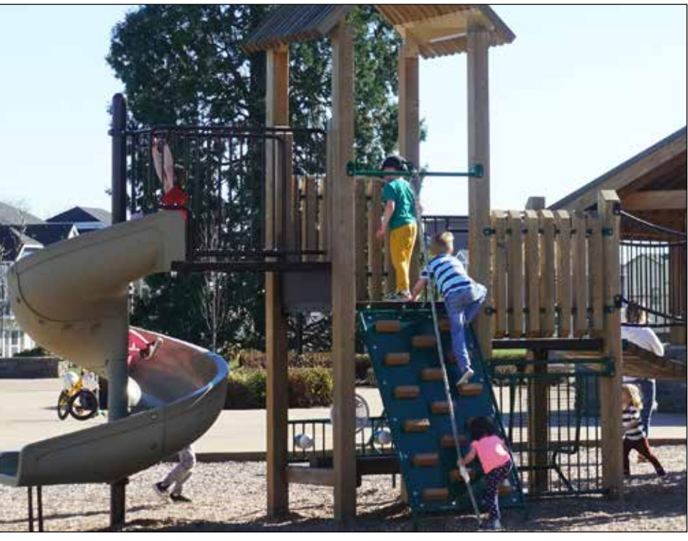
Edelweiss Park in Villebois is one of five completed parks along the Villebois Greenway. Three new parks are about to be constructed, more than doubling the size of the greenway and providing new amenities.

At the Village Center, the City's economic development staff is working to incentivize mixed-use development by considering a Vertical Housing Develop-