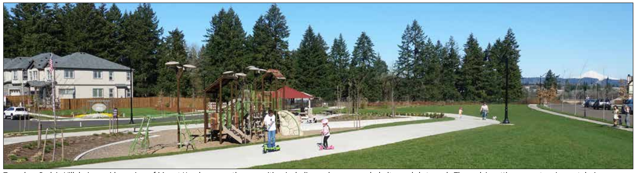
Trocadero Park in Villebois provides a view of Mount Hood among other amenities, including a play area, park shelter and skate park. The park is getting a new tennis court during an upcoming project to complete the remaining 18 acres of the community's 33-acre linear park along the regional Ice Age Tonquin Trail.