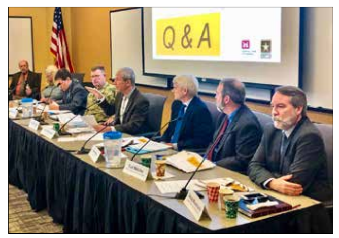
Watch the Willamette River basin watershed presentation online: youtube.com/watch?v=ZSEvfTSiOw0

In February, the City of Wilsonville hosted Congressman Kurt Schrader on behalf of the Oregon Congressional Delegation for a presentation on issues pertaining to the Willamette River basin watershed.