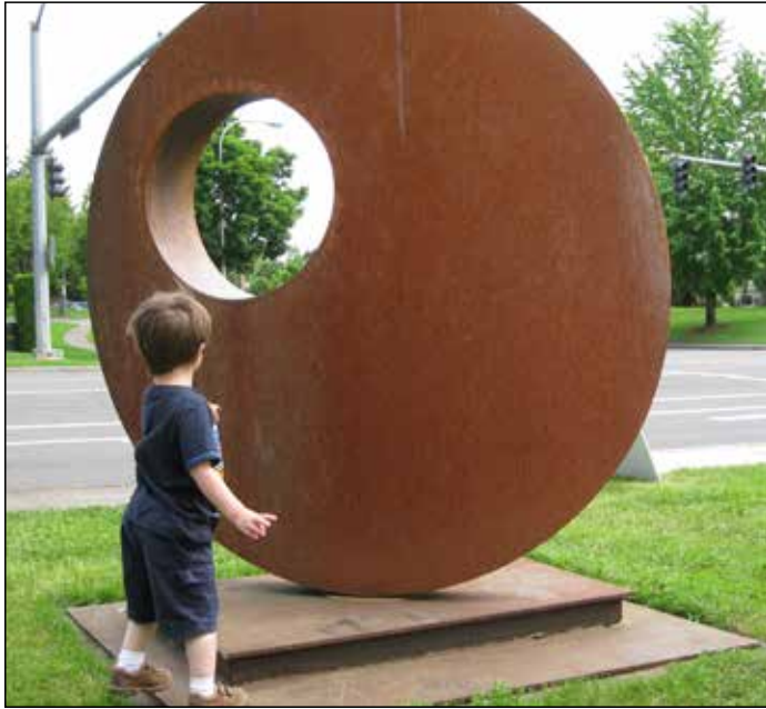
How do you interact with art? The City of Wilsonville is undertaking a project to gather information to inform the City's strategic investment in artistic and cultural programs and activities. An online survey is available until October 7.

In addition to stakeholder interviews and the survey, the Arts Alliance is working to plan a community meeting in October to discuss interview and survey results and draft a strategic action plan.