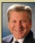
Scott Starr City Council President