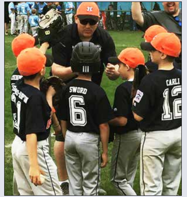
Wilsonville Little League is among recent recipients of the City's Community Opportunity Grant program. A new funding cycle is now underway.