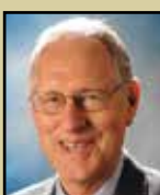
Tim Knapp Mayor

The City Council usually convenes on the first and third Monday of the month at City Hall, with work session generally starting at 5 pm and meeting at 7 pm. Meetings are broadcast live on Comcast/Xfinity Ch. 30 and Frontier Ch. 32 and are replayed periodically. Meetings are also available to stream live or on demand at www.ci.wilsonville.or.us/WilsonvilleTV . Public comment is welcome at City Council meetings.