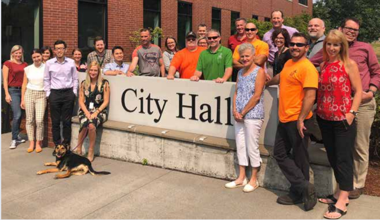
In support of August's national #cityhallselfie campaign on social media, City of Wilsonville staff (and Tahlia the dog) got in the spirit, sharing the photo on Facebook, Instagram and Twitter.