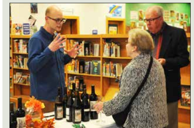
Guests enjoy wine tasting and appetizers at the Third Annual Wine-Tasting Event.