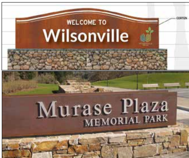
A public open house and online survey revealed the community's preference for a preliminary design (top) inspired by existing elements, including the sign at Murase Plaza (bottom).

"We've reviewed 200+ comments on what people liked about the design, and what they would change," Stewart said. "We are incorporating this information