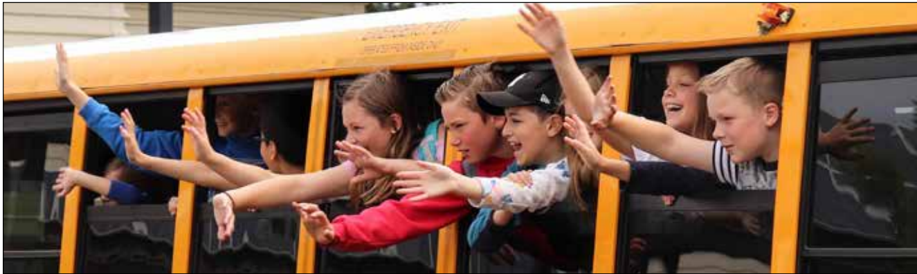
On August 27, Wilsonville schools welcomed students for the 2018-19 school year. Meet the new principal at Lowrie Primary and learn a few safety tips to pass on to kids who will be home alone after school for the first time (page 7).