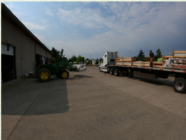
Unloading 3 Shelters