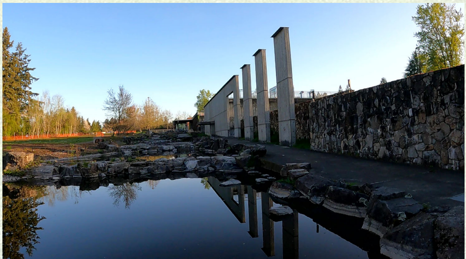
Eco Friendly Algae Cleanup