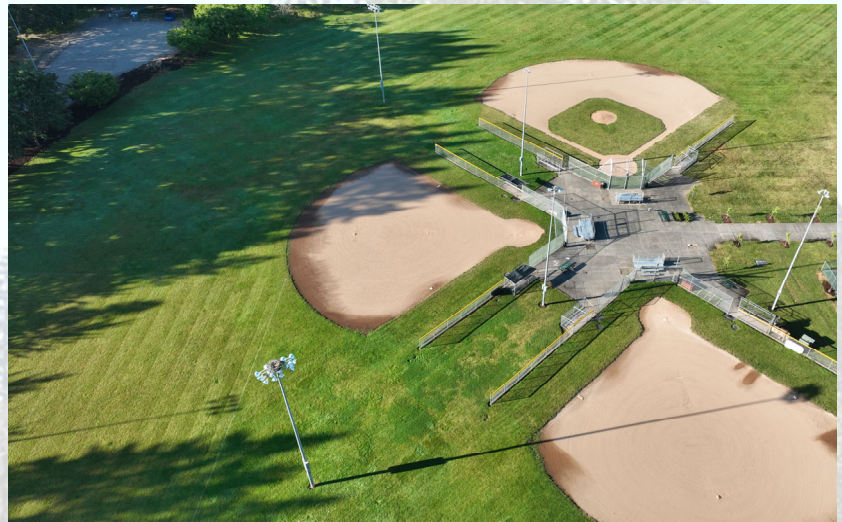
Drone View of Memorial Park