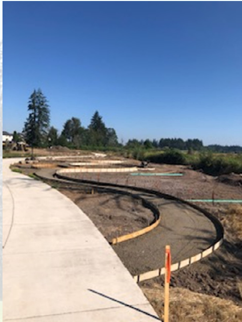
Nature Play Area Sidewalks