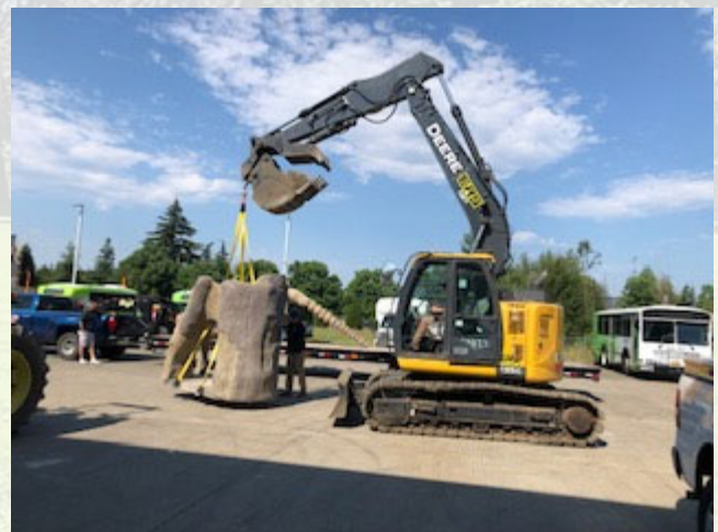
New Playground Feature