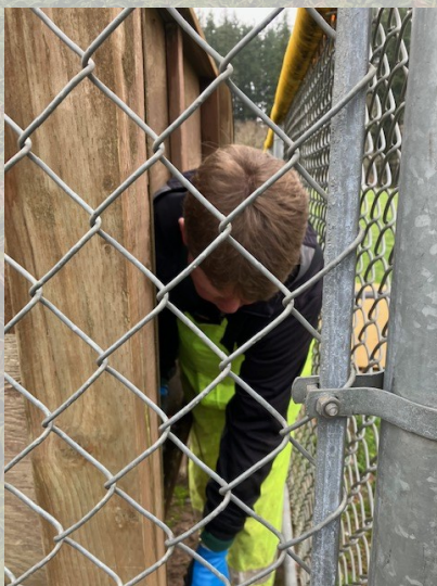
Removing Original Wood Supports

Park and Recreation Teammates worked closely with a contractor to implement an updated support structure for the power panels in Memorial Park. These panels ensure lighting on most of the athletic spaces in Memorial Park. The improvement will help ensure safe and reliable function for years to come.