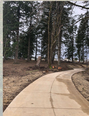
Understory Cleared of Blackberries