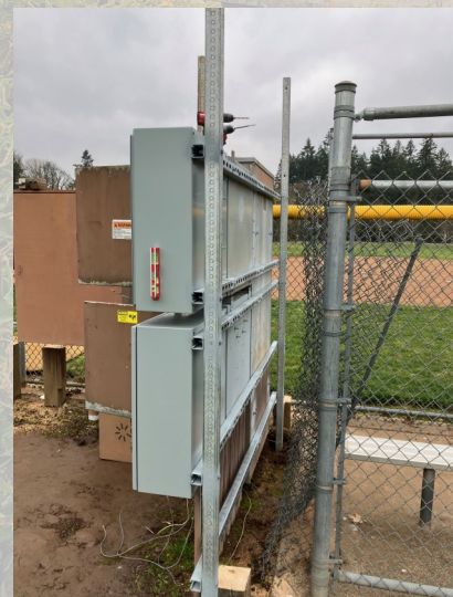
New Metal Supports