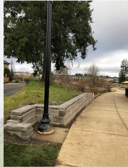
New Retaining Wall Installed