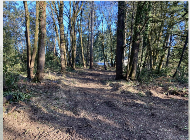
Forested area on Trail