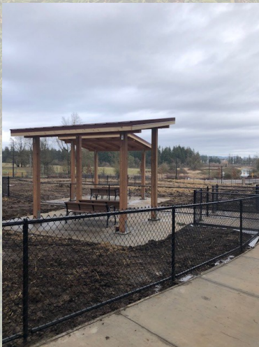
Dog Park Shelters