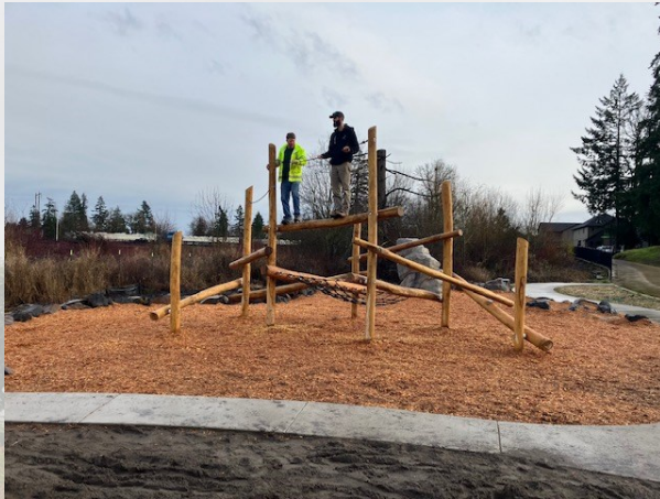
Testing the New Playground