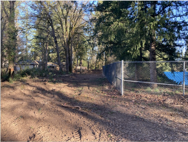
Start of Trail near Tauchman St.

The team has made great progress on the new .19 mile trail extension in the north section of Boones Ferry Park in January. Clearing away invasive blackberry and prepping the path area as well as clearing problem trees were on the to-do list this month. The team will continue to work into the summer to begin a forest restoration and trail installation in this area.