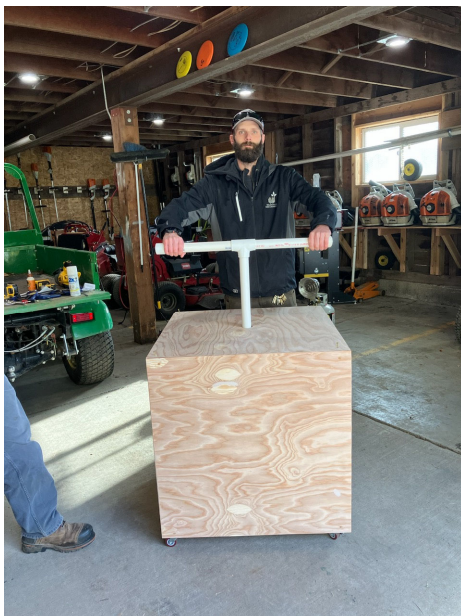
Getting Creative with the Tree Lighting Switch