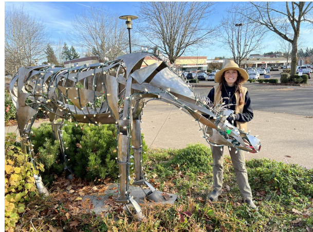
Installed Holiday Lights in Town Center Park