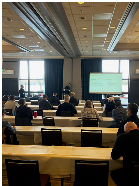
Attended and Presented at ORPA Conference in Portland