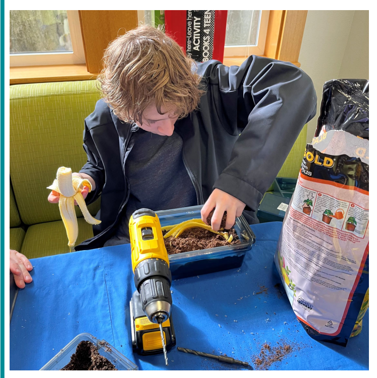
A teen assembling his worm bin at the Early Release Day teen event on March 6.

• On March 23, we had Spanish Storytime and "Saturday Classic Movie & Family Board Games".