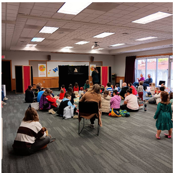
Storytime on March 13 starred a puppet show and a bunny ear craft.

• On March 23, we had Spanish Storytime and "Saturday Classic Movie & Family Board Games".