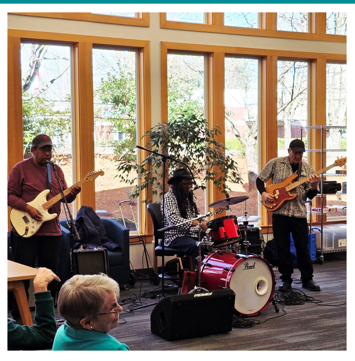
Reggae group Rhythm Culture performed at the Book Notes concert on Saturday, March 9.

National Poetry Month and a PROFILES online presentation about the sonnet on Wednesday, April 3, at 11am on Zoom.