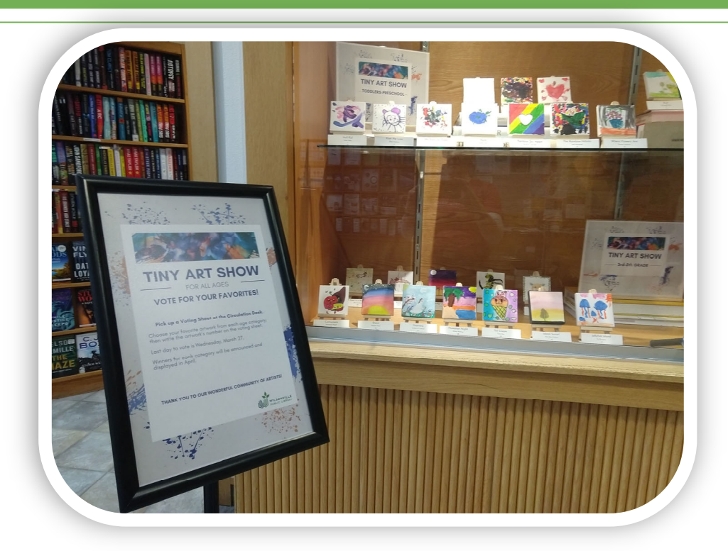
The Tiny Art Show was on display in the Library lobby through the month of March.