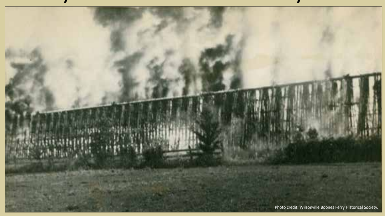
The southern approach to the Oregon Electric Railway trestle bridge caught fire in July 1939.