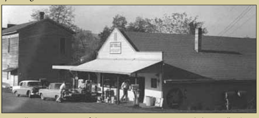
Butteville Store, circa 1961.

The store is open weekends until Memorial Day, and then open every day 9 am–6 pm. For more information, go online to www.butteville.org or contact Ben Williams at 503-568-5670 or Dori Brattain at 503-678-1605.