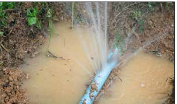
Spring has sprung. Has a leak? The City recommends that residents inspect irrigation systems before regular use. Early detection can lower water usage charges.

• Perform a visual inspection of the sprinkler system and look for broken sprinkler heads, mushy lawn, pooling, or sprinkler heads that do not activate. All of these can be signs of a leak.