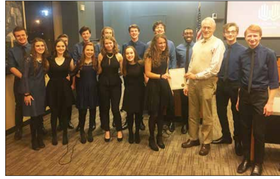
Soul'd Out, Wilsonville High School's a cappella choir, will compete in the International Finals on April 20 in New York City. Council commemorated their achievement with a proclamation declaring March 5-11 as Soul'd Out Week.