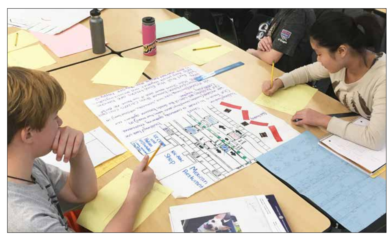
Meridian Creek Middle School math students jot down notes and review their main street renderings just before presenting their concepts to Wilsonville Town Center staff in February. The students drew their plans to scale and submitted them as part of a collaboration with the school to involve youth in Town Center planning.

For more information on the community vision for the Town Center, visit www.WilsonvilleTownCenter. com.