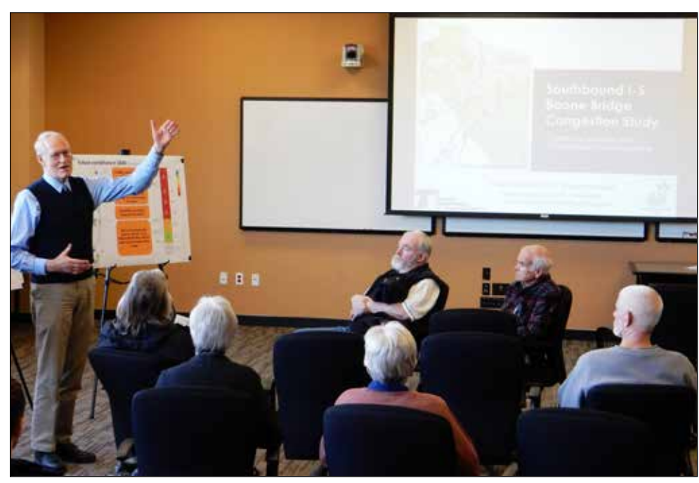
Wilsonville Mayor Tim Knapp addressed community members at a March 14 open house hosted by the City and the Oregon Department of Transportation. The meeting included discussion of proposal to build a ramp-to-ramp lane on I-5 Southbound over the Boone Bridge to alleviate congestion and improve commute times.

The public may comment on the recommendations to the Planning Commission on April 11 and City Council on May 21. ODOT is also accepting public comment on the study, starting in early April. To weigh in or to learn more, visit: www.ci.Wilsonville.or.us/I-5BooneBridge