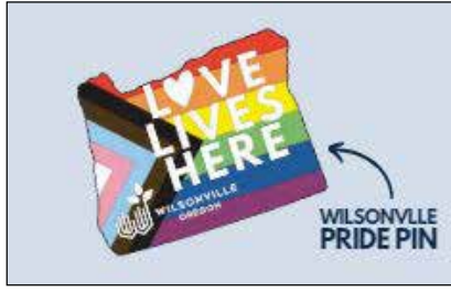
Wilsonville Pride pins are available to guests attending the June 2 Pride Month mural reception.

Pride celebrations first took place in June 1970 to commemorate the first anniversary of the Stonewall riots, a series of gay liberation protests that took place 1969. LGBTQIA+ Pride Month has been celebrated more formally in the United States since 1999, when a presidential declaration officially recognized Pride Month.