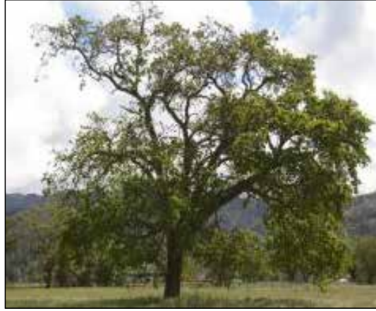
A thinning of the crown is a telltale sign of infestation in Oregon white oaks.

To support state-wide efforts to protect these trees, the best thing homeowners can do is provide proper care. Prune broken branches, quickly address pests that may be draining resources from the trees, and monitor trees closely. If summer is hot and dry, water