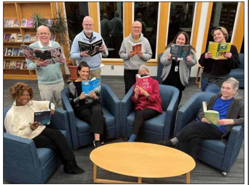
Wilsonville Public Library Foundation members, Library Board members and Library staff get a head start on the WPFL’s May fundraiser.

For more information on the foundation’s work, or to make an online donation, visit wplf.org . Donations can be also be made in person at the Wilsonville Public Library.