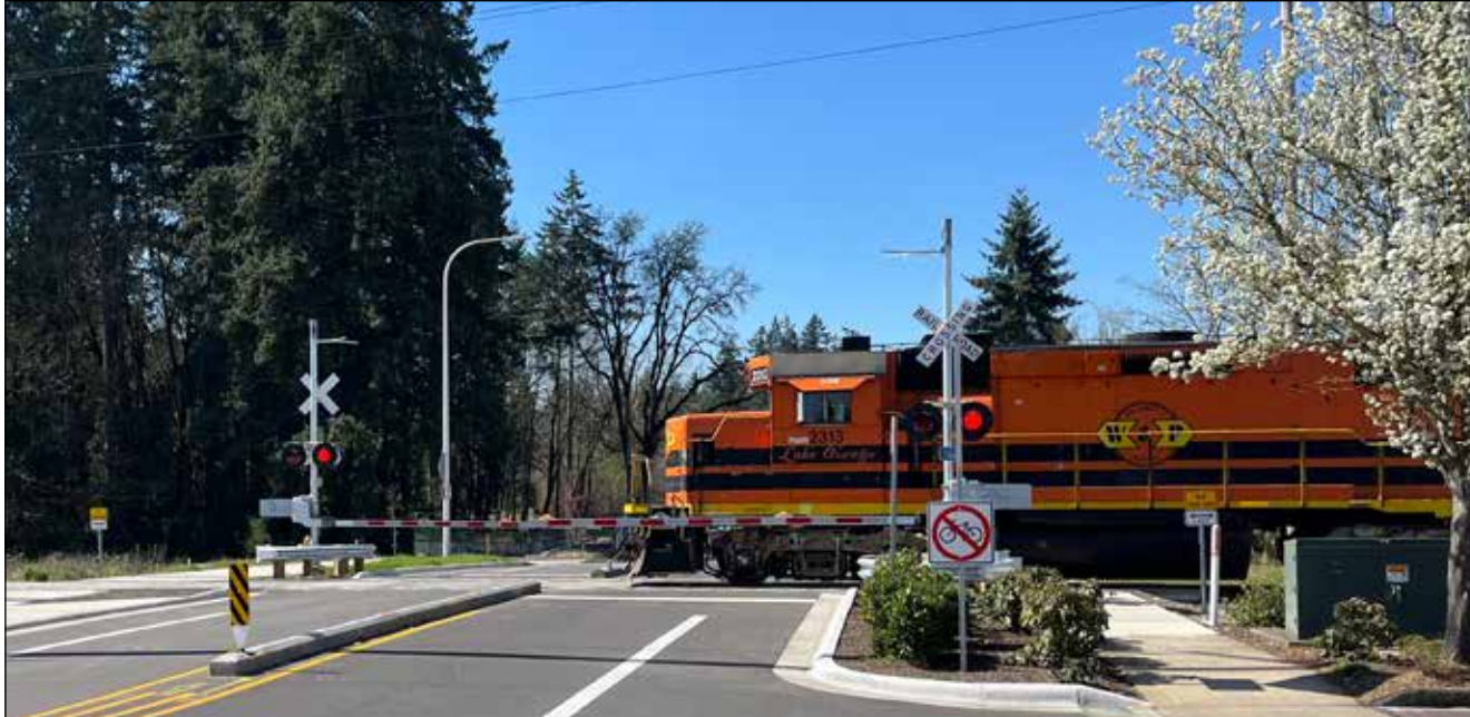
The City worked with several agencies to establish a quiet zone in Old Town. Trains traveling through the neighborhood no longer sound their horn now unless there is an immediate safety concern.