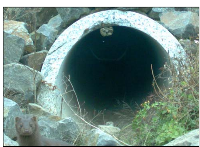
Can you find the mink?

There are a number of specialized structures to accommodate the safe movement of wildlife under Boeckman Road. There is a large bridge structure with an 8' clearance as well as 4' tall x 9' wide box culverts to accommodate the migration of deer and other large mammals. Smaller culverts accommodate the safe movement of animals such as coyotes, raccoons, and opossums. The road design not only includes passages for mammals, but there are concrete walls with ledges and smaller scale connections for amphibians such as frogs, salamanders, and newts.