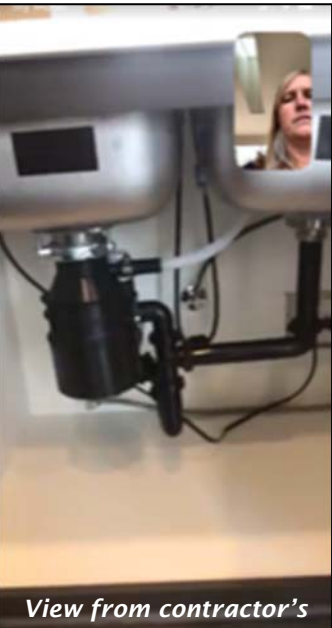
View from contractor's phone.

uncontrolled environment is great! Thanks so much for working with us so we can take care of our customers! We appreciate it!".