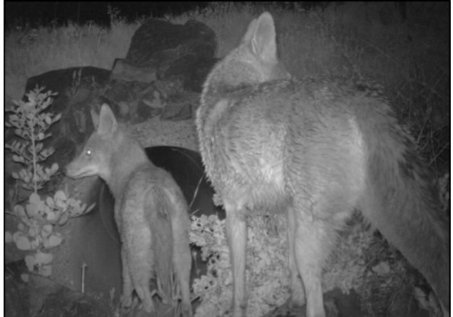
Coyotes preparing for a late evening crossing.

Along Boeckman and Kinsman Roads are additional elements such as skylights that have been designed into the roadbed to allow for sunlight to penetrate the long, dark tunnels, making them more inviting for animals to use. Chain link fencing along the edges of the roadway funnels animals to the wildlife crossings and keeps them off the roadway, helping to prevent roadkill. All of these measures demonstrate a holistic approach to transportation planning and wildlife movement.