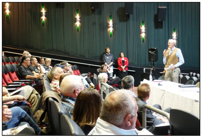
Mayor addresses business community at Regal Cinemas during the Economic Summit Panel event.