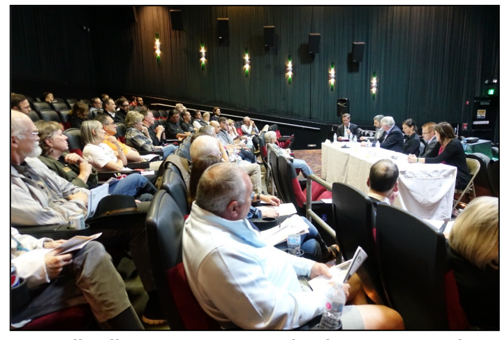
Panelist discuss Town Center development scenarios during the October 11 Economic Summit Panel event.