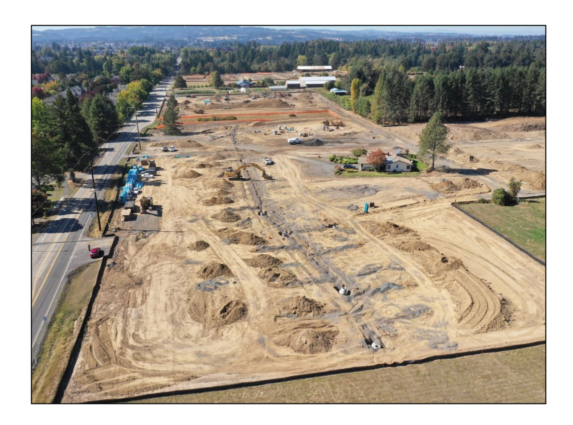
Stafford Meadows under construction.

Public Works Permit issued for this 68-lot subdivision near Villebois Drive and Orleans Avenue.