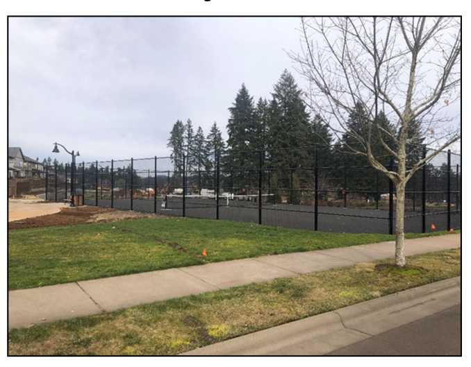
New tennis courts at Regional Parks 5 & 6