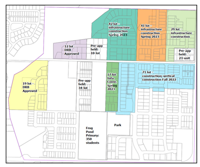
Frog Pond West

Nestled between Garden Acres and Grahams Ferry Roads, this project will include frontage improvements along Garden Acres and Grahams Ferry Roads and construction of a new supporting street. Onsite work and vertical construction continue. Installation of street improvements along Grahams Ferry Road is underway. Construction is anticipated to be complete late this spring.