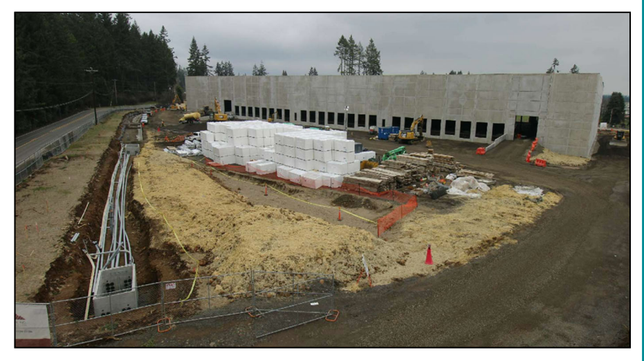
Black Creek Industrial