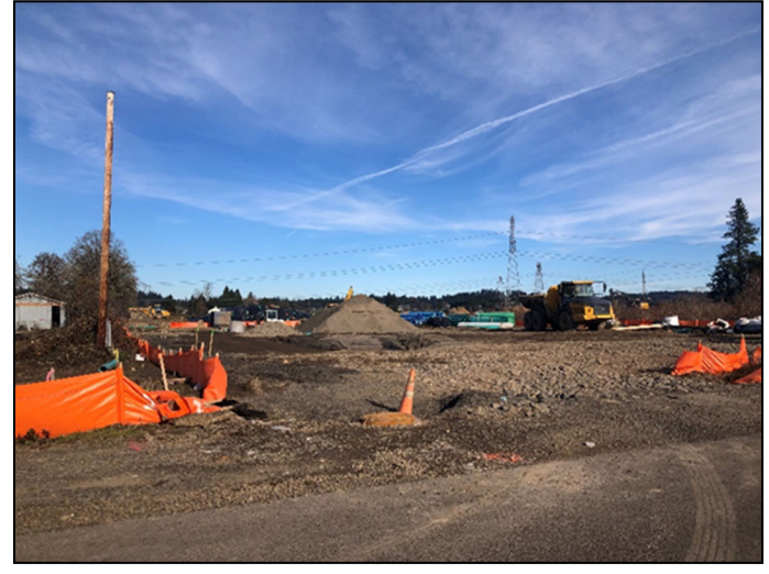
Frog Pond West

Nestled between Garden Acres and Grahams Ferry Roads, this project will include frontage improvements along Garden Acres and Grahams Ferry Roads and construction of a new supporting street. Onsite work continues. Vertical construction has commenced. Street improvements are anticipated to begin in January 2023.