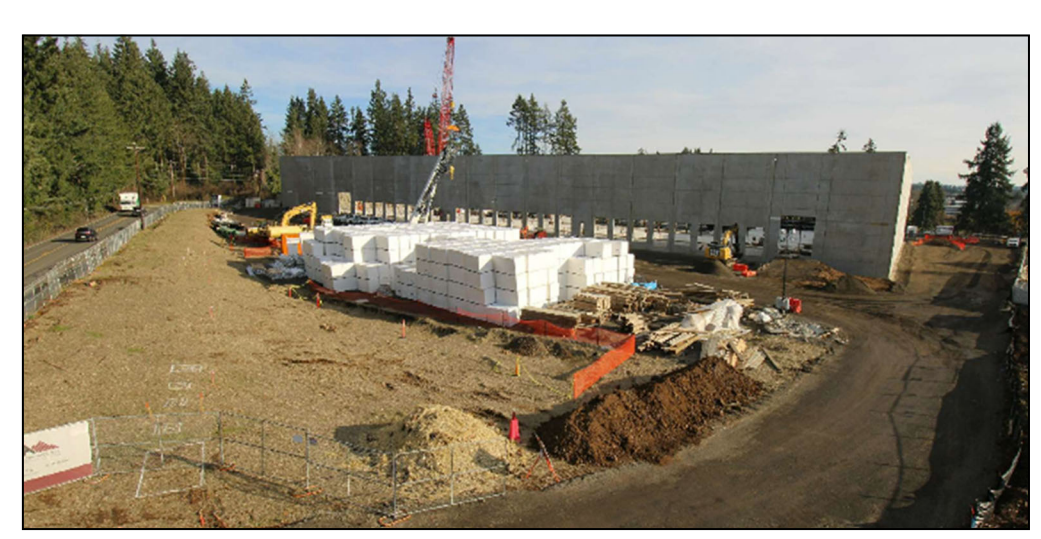
Black Creek Industrial