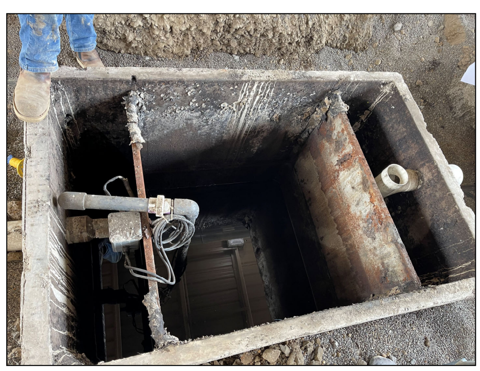
Oil separator vault-bad, removed from service

Diligent inspections and sampling by the Industrial Pretreatment and the Natural Resources Divisions along with continuous construction contractor education keep our systems safe.