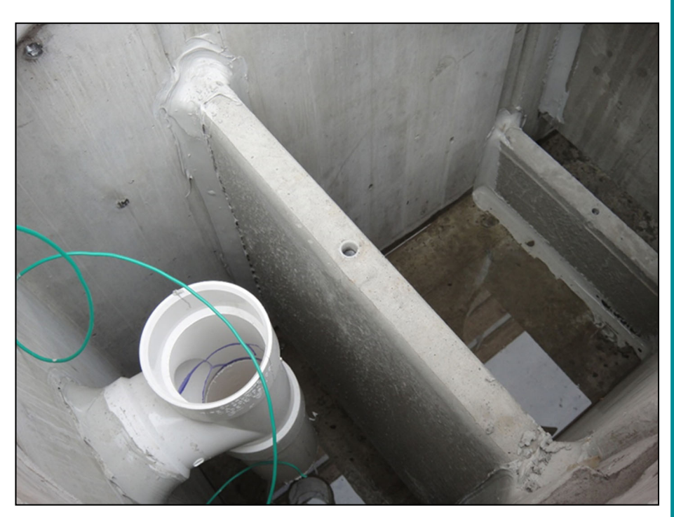
Oil separator vault-new replacement