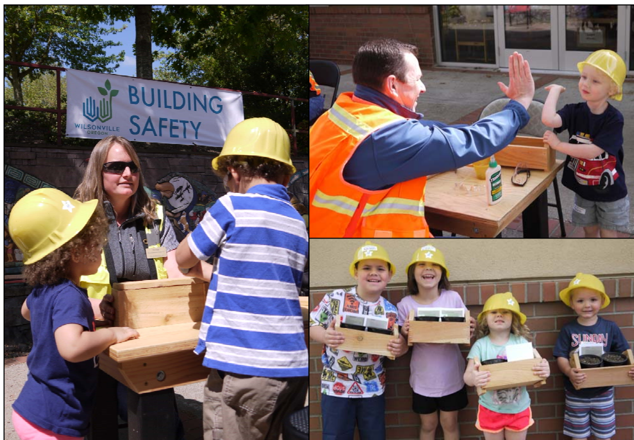
May 1-5, 2019

For questions about building safety and other construction topics, Building Inspection staff are a resource and happy to answer questions. In addition, the Building Safety Month website has some great resources available year-round at www.BuildingSafetyMonth.org .