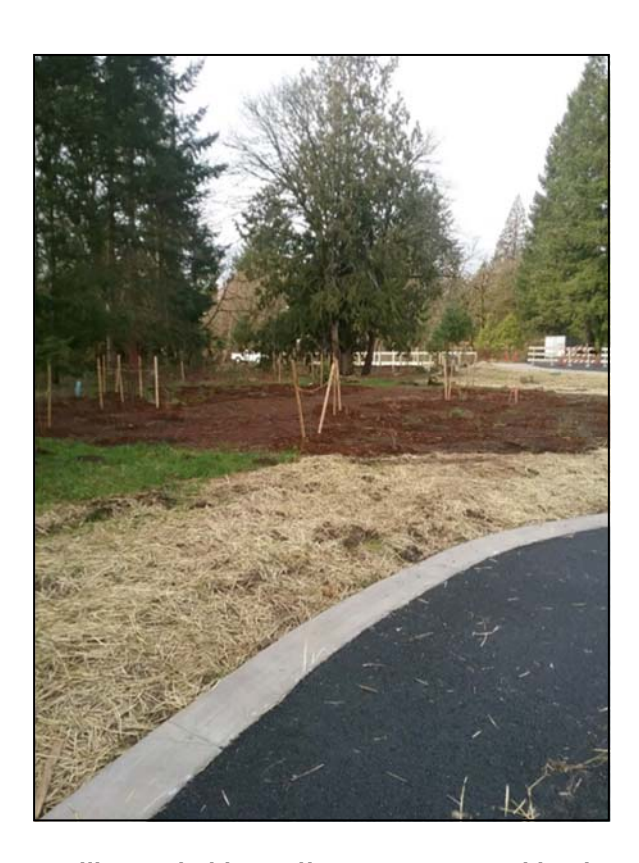
Pollinator habitat adjacent to new parking lot.

In November and December 2018, the City and Friends of Trees hosted two pollinator-planting events at Memorial Park. One of the sites is located directly adjacent to the new Community Garden and Dog Run parking lot and the other site is near Rose Lane. Over 150 volunteers participated in the planting events, which included the installation of native plants important to a variety of pollinators.