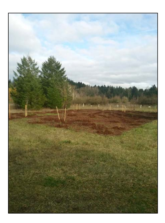
Pollinator habitat near Rose Lane.