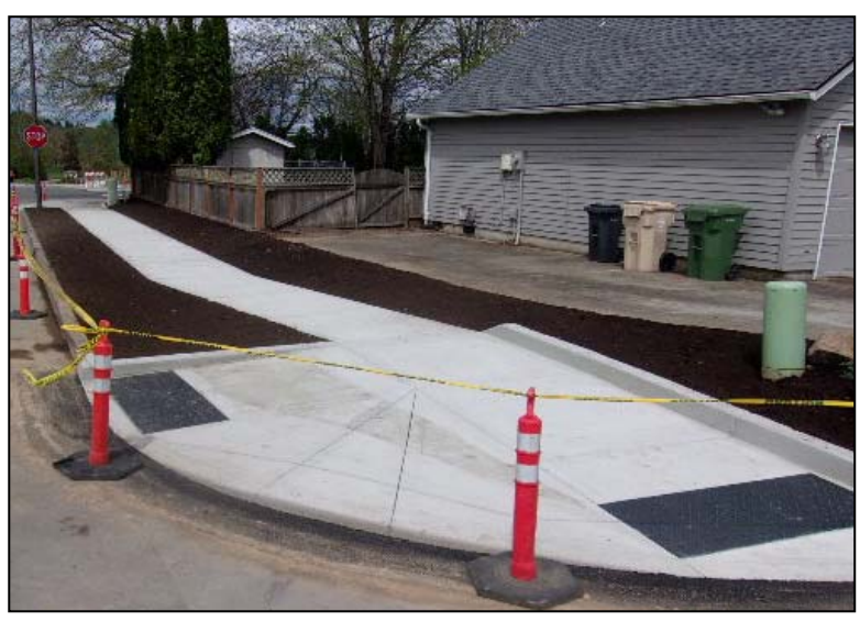
New sidewalk between Jamaica and Wilsonville Road across from Graham Oaks Nature Park.

Greetings! The Planning Division completed two major multi-year long-range planning initiatives this month with the City Council adoption of the Basalt Creek Comprehensive Plan and Transportation System Plan amendments, as well as the adoption of the forward thinking, visionary Town Center Plan. These significant community initiatives lay the groundwork for transformation of the community over the long-term, creating future opportunities for job creation, economic development, and a vibrant city center with year round place making. Both projects were identified as City Council goals. Staff is pleased to be able to finish these two important goals, as the Council goal