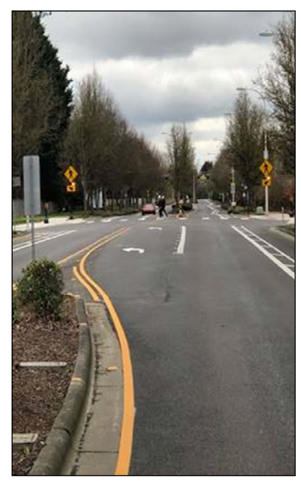
Repaved and restriped roadway, the replaced curb ramps (which now meet ADA standards), as well as the new pedestrian activated beacons on Wilsonville Road at Guiss Way/ Orchard Drive

The underground construction and restoration project is complete. The installation of the surge tank was completed in November 2019. A certificate of final completion was issued in February 2020.