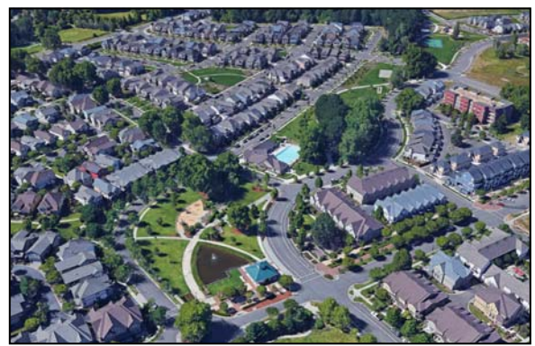
Aerial photo of Villebois .

periodic Housing Production Strategy. For the Housing Needs Analysis, DLCD informed City staff that the next Wilsonville HNA will be due to DLCD is by the end of 2023. The submittal deadline will then be on an every-six-year cycle. As Housing Production Strategies are a new requirement, to be completed by a City within a year of completing a HNA, a substantial amount of state administrative rulemaking needs to occur to define them. Staff participated in the first meeting of the state's Technical Advisory Committee (TAC) for rulemaking on Housing Production Strategies on February 6.