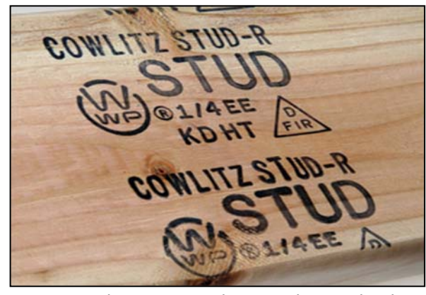
WWP markings stamped on rough sawn lumber

The construction industry depends upon accredited agencies to evaluate the structural value and integrity of wood materials used for all wooden structures. Two such