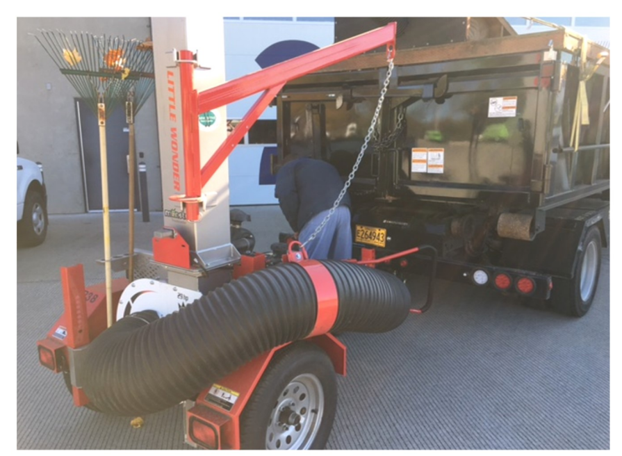
Fleet Mechanic Scott Wright repairs wiring on a leaf vacuum unit

The focus of the Fleet crew changes with the seasons. In October, our focus turned to items such as leaf removal equipment. From leaf vacuums to backpack blowers, we must ensure that these tools and equipment are ready for use by the Public Works and Parks workers. In addition, some equipment items such as mowers, which are rarely utilized in the fall and winter months, are prepared for storage.