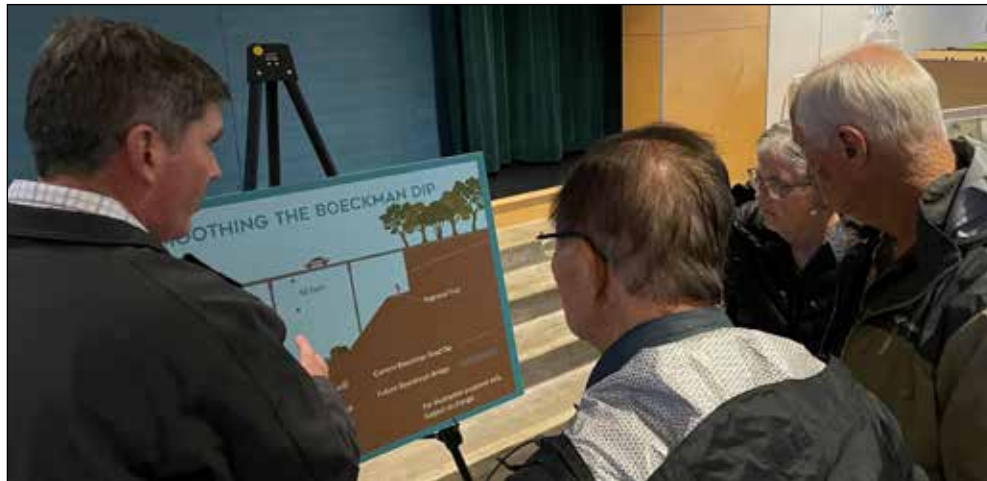
At a January open house, City engineers developing the Boeckman Road Corridor Improvement Program detailed the project, introduced the contractor and answered questions about the pending construction on Boeckman Rd.

Yes. Planning is underway for streetlights along SW Boeckman Rd. The exact placement of streetlighting is under design.