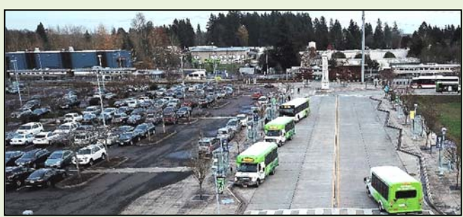
The Wilsonville SMART Transit Center serves as the TriMet Westside Express Service (WES) commuter rail train station that features a 400-car park-and-ride lot that can be expanded. Each WES train is met by SMART buses that whisk employees to the worksite within 10 minutes of arrival in Wilsonville, providing key 'last-mile' public transit service.