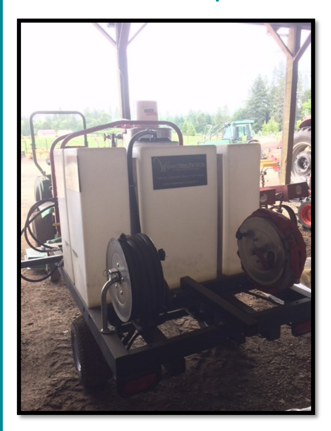
Continued Work on IPM plan