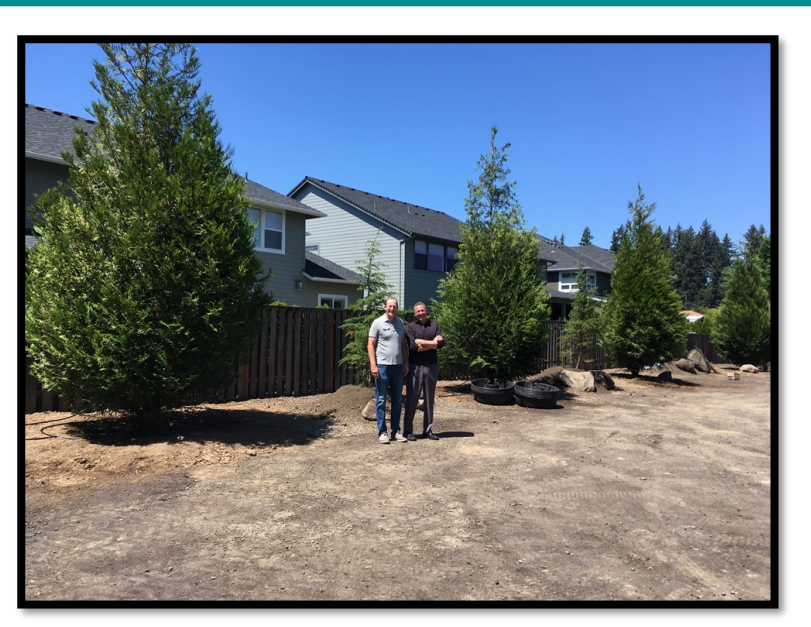
Planted trees at Memorial Park River Shelter Parking lot as part of Master Plan implementation