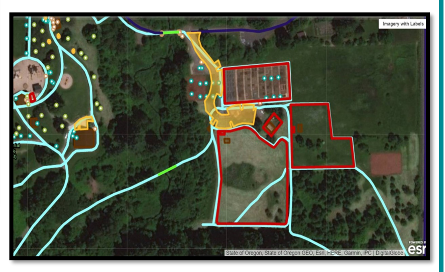
Continued implementation of Memorial Park Master-Plan (Cartegraph outlining of relocated dog park)