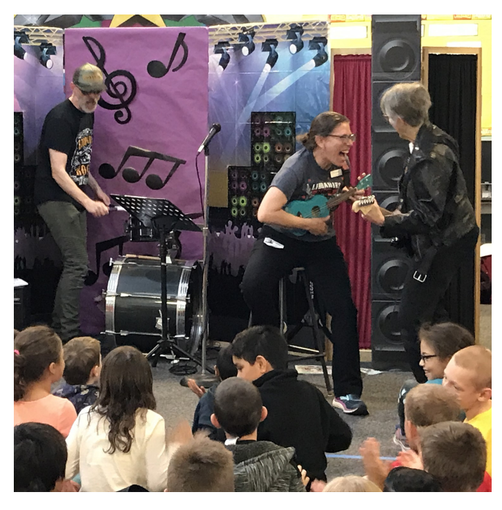
Youth Services staff performing their promotional skit for the Summer Reading Program