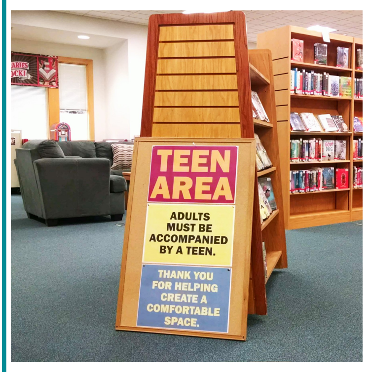
The Teen Area behind the Adult Fiction collection