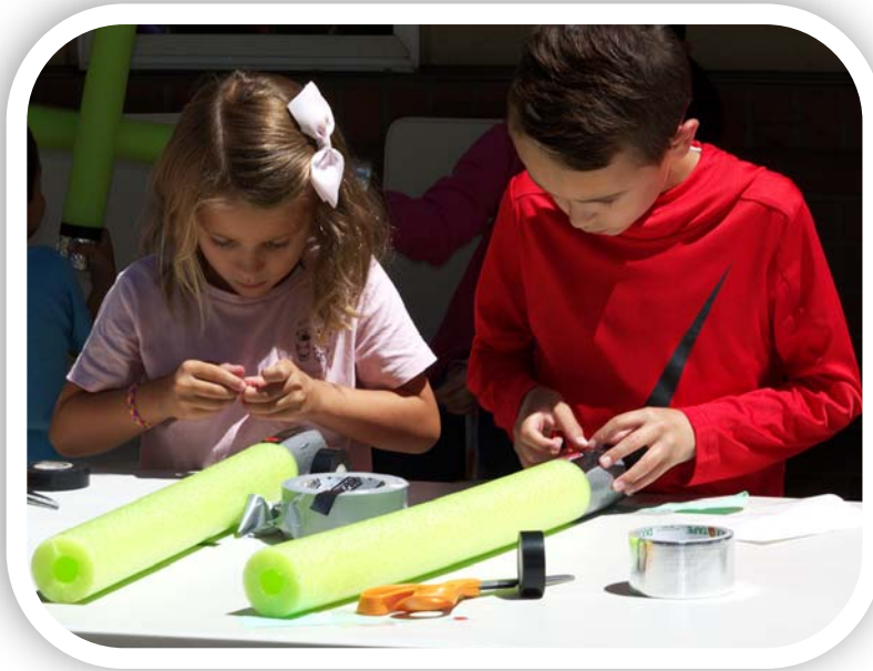
Kids making foam "lightsabers" on Star Wars Day on July 18.