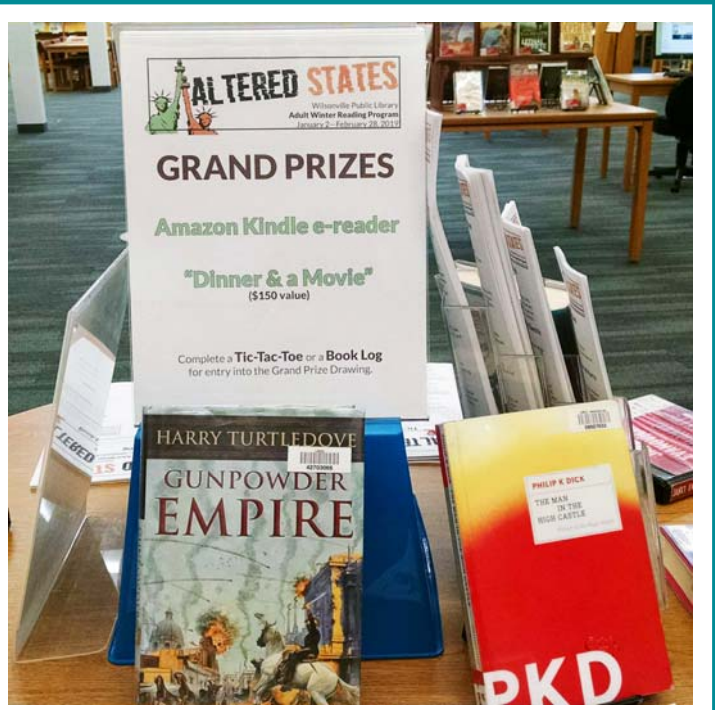
The 8th annual Adult Winter Reading Program started January 2.

A four-week class introducing students to the Spanish-speaking world through language and multimedia presentations began January 23.