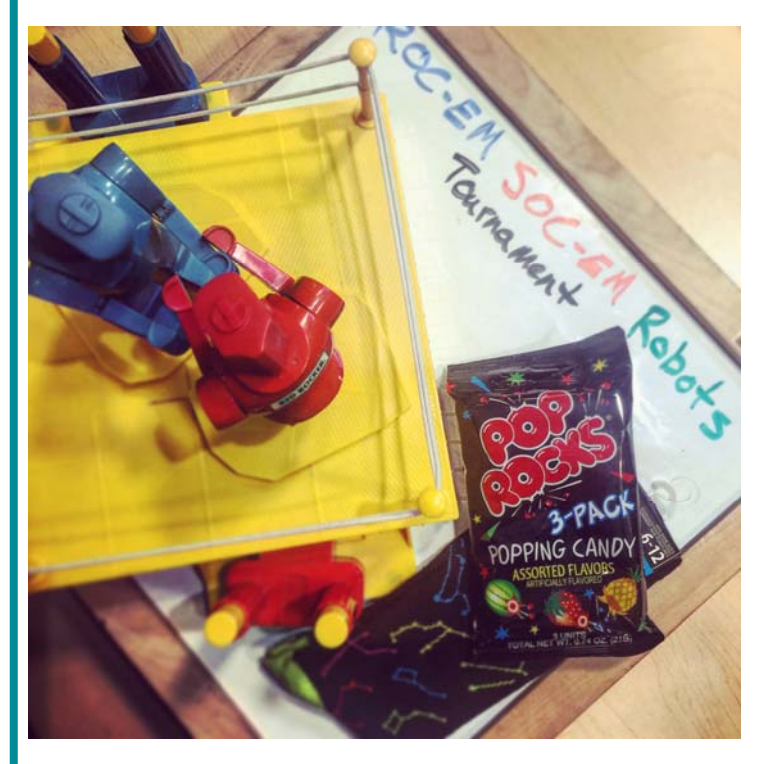
Games and prizes for the promotion event at middle schools in January.