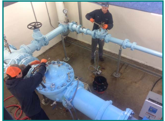
Contractors rebuilding one of the water system cla-va valves

GC Systems was in town this month to rebuild a handful of Cla-Val automatic control valves in the distribution system. An automatic control valve is a sophisticated valve that can automatically open or close based on a set pressure differential between the upstream and downstream sides of the valve. These valves help us control the flow of water throughout the city and help assure appropriate pressures in areas to fight fires and assure pressure. Every year a select number of Cla-Val's in the system are rebuilt to ensure they are operating properly.