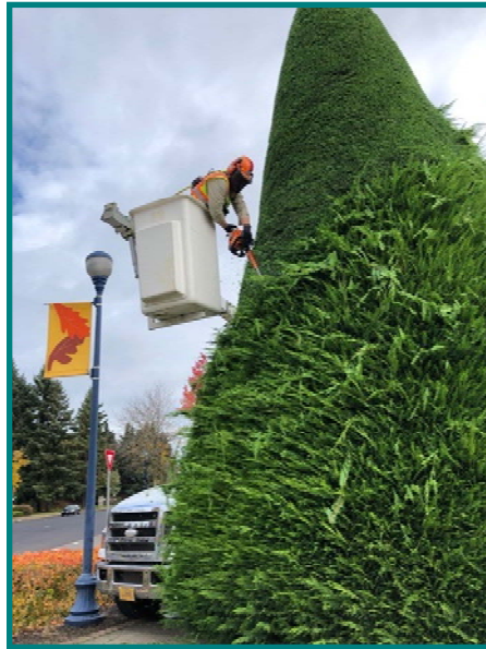
Half way done