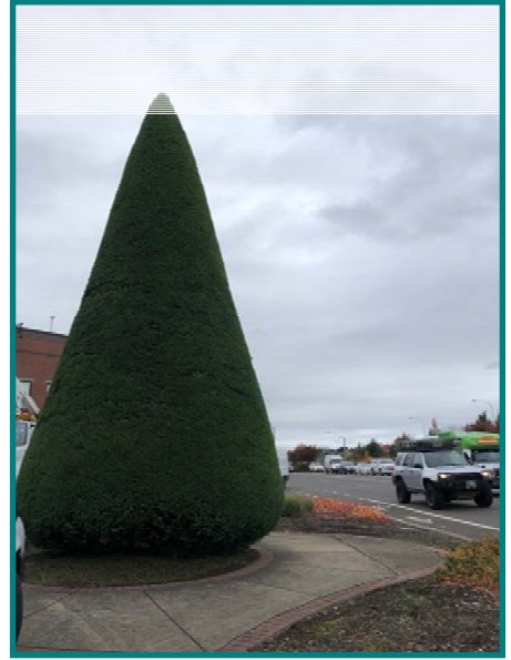
Trimmed and ready to decorate