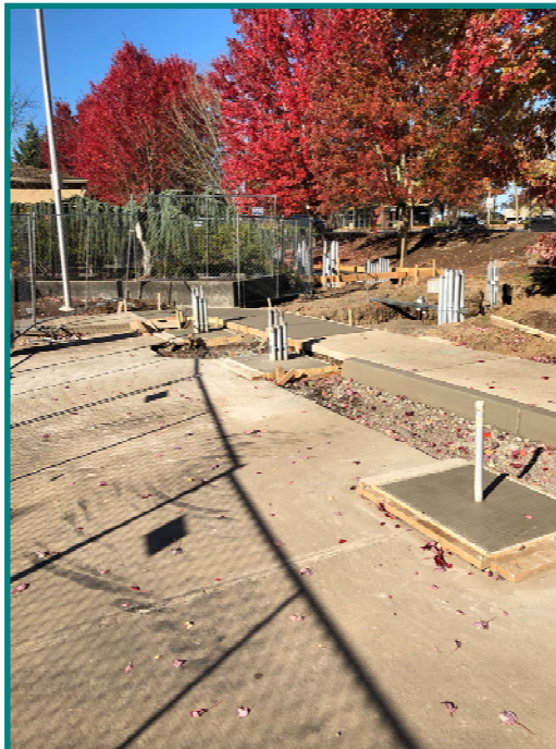
Looking west towards the Library

Construction of this project is well underway and it is anticipated it will be completed by the end of 2019.