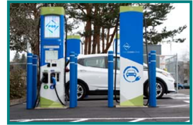
Example of a Charging Station

The City of Wilsonville continues to innovate and progress towards a more sustainable community. In addition to the Smart Cities Pilot Project which was highlighted in Public Works September's Monthly Report, the City has a cooperative agreement with Portland General Electric (PGE) to construct one of six Electric Avenue Charging Stations within the Portland metro area.