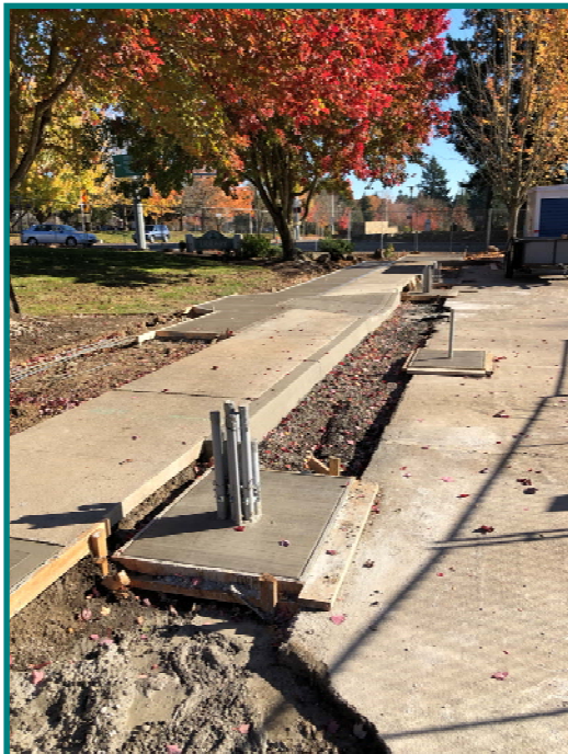
Looking east towards Memorial Drive

The charging stations will consist of both Level 2 and DC Fast Charging equipment. Level 2 Charging Stations are more commonly known and can provide an electric vehicle an additional 21 mile range with a 60-minute charge. The larger and more powerful DC Fast Charging Stations are able to supply an electric vehicle with an additional 75 mile range with a 30-minute charge time.