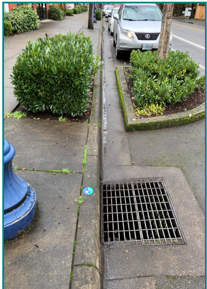
New approaches to known problem areas were addressed to assure the community an increased level of service.