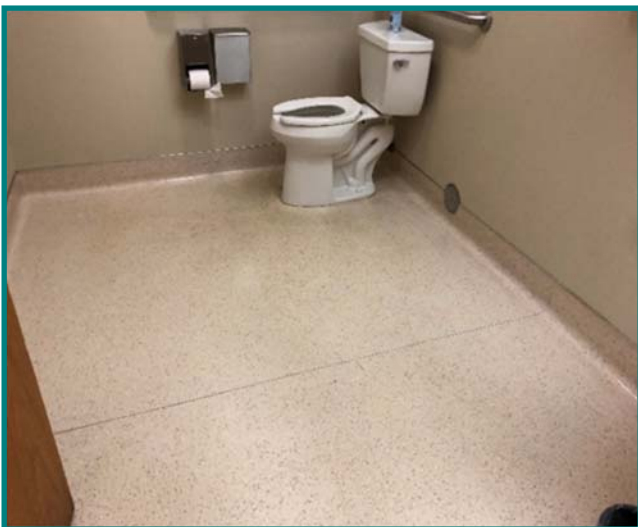
Community Center ~ Before

While at the International Facility Conference in October, Facility Technicians Javid Yamin and Ivan Crumrine discovered a new state-of-the-art floor refinishing method that offered unparalleled durability, anti-microbial sealant, and a beautiful aesthetic design. The flooring system also provides superior slip-resistant finish, which is a very important factor in the Community Center. Due to permanent stains and some material failure both of the hallway restrooms underwent this transformation.