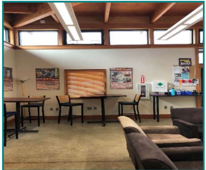
WES ~ After

While at the International Facility Conference in October, Facility Technicians Javid Yamin and Ivan Crumrine discovered a new state-of-the-art floor refinishing method that offered unparalleled durability, anti-microbial sealant, and a beautiful aesthetic design. The flooring system also provides superior slip-resistant finish, which is a very important factor in the Community Center. Due to permanent stains and some material failure both of the hallway restrooms underwent this transformation.