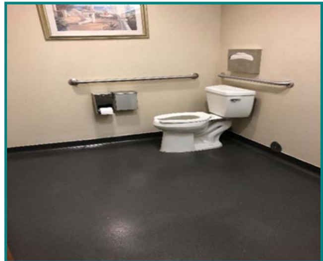
Community Center ~ After