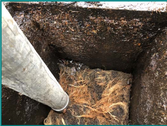
Stormwater Maintenance Specialists Jay Herber and Randy Burnham clear a root engulfed catch basin with the vacor

During the week of January 6 the Public Works Department received a phone call about some flooding that was occurring on Wilson Lane. Water was backing up out of the catch basins and flooding the street. The stormwater crew was dispatched to investigate the situation. They found catch basins and storm lines completely full of roots which had infiltrated the storm system. The crew cleared roots out of 80 feet of 12" diameter pipe which instantaneously reduced the flooding on Wilson Lane. Stormwater personnel will continue the clearing roots from the catch basins and an additional 400 feet of pipe with the goal of having this area completely root free by the end of February.