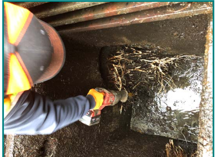
Randy Burnham cutting root out of a catch basin with saw