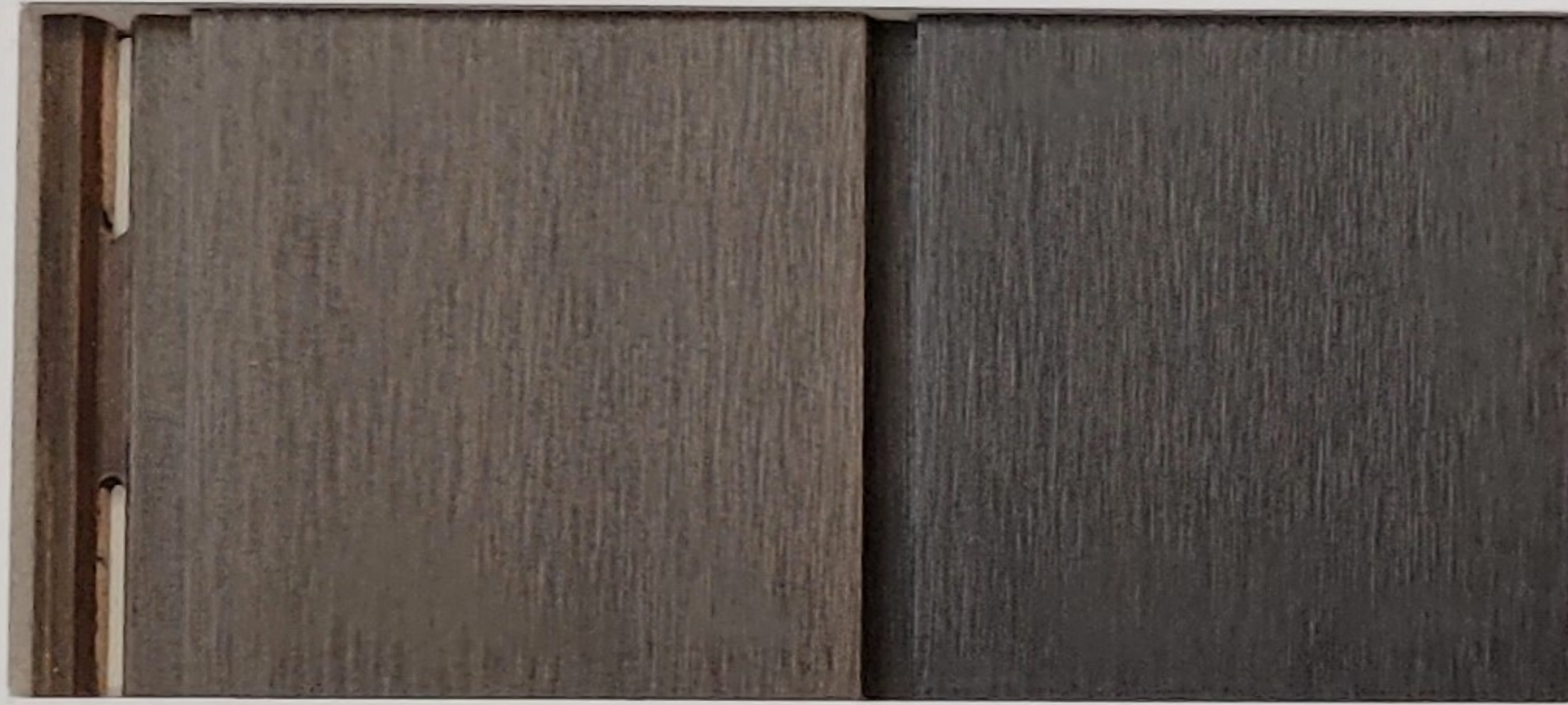
COMPOSITE WOOD SIDING - Accents at recesses

PRODUCT: RESYSTA COLOR: DARK SIAM, 2-COAT FINISH SIZE: DARK SIAM, 2-COAT FINISH DETAILS: VERTICAL ORIENTATION, ALIGNED HORIZONTAL JOINTS AT EACH FLOOR