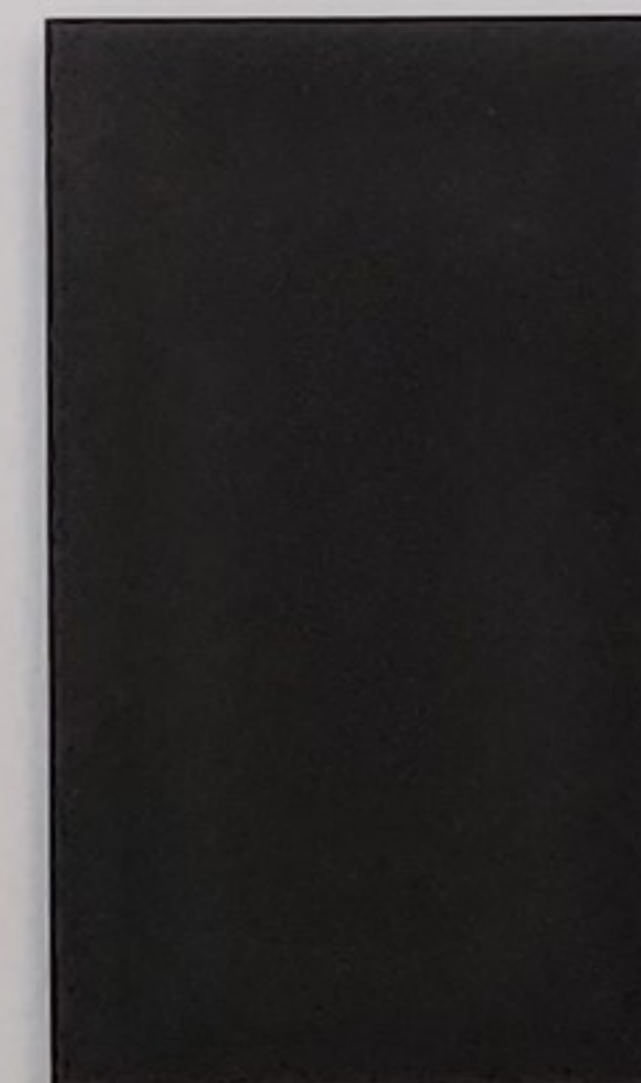
BLACK METAL - Sheet Metal flashings, Storefront, Canopies, Guardrails

PRODUCT: LOW-E COATED, PPG 'SOLARBAN 60', OR SIMILAR COLOR: CLEAR