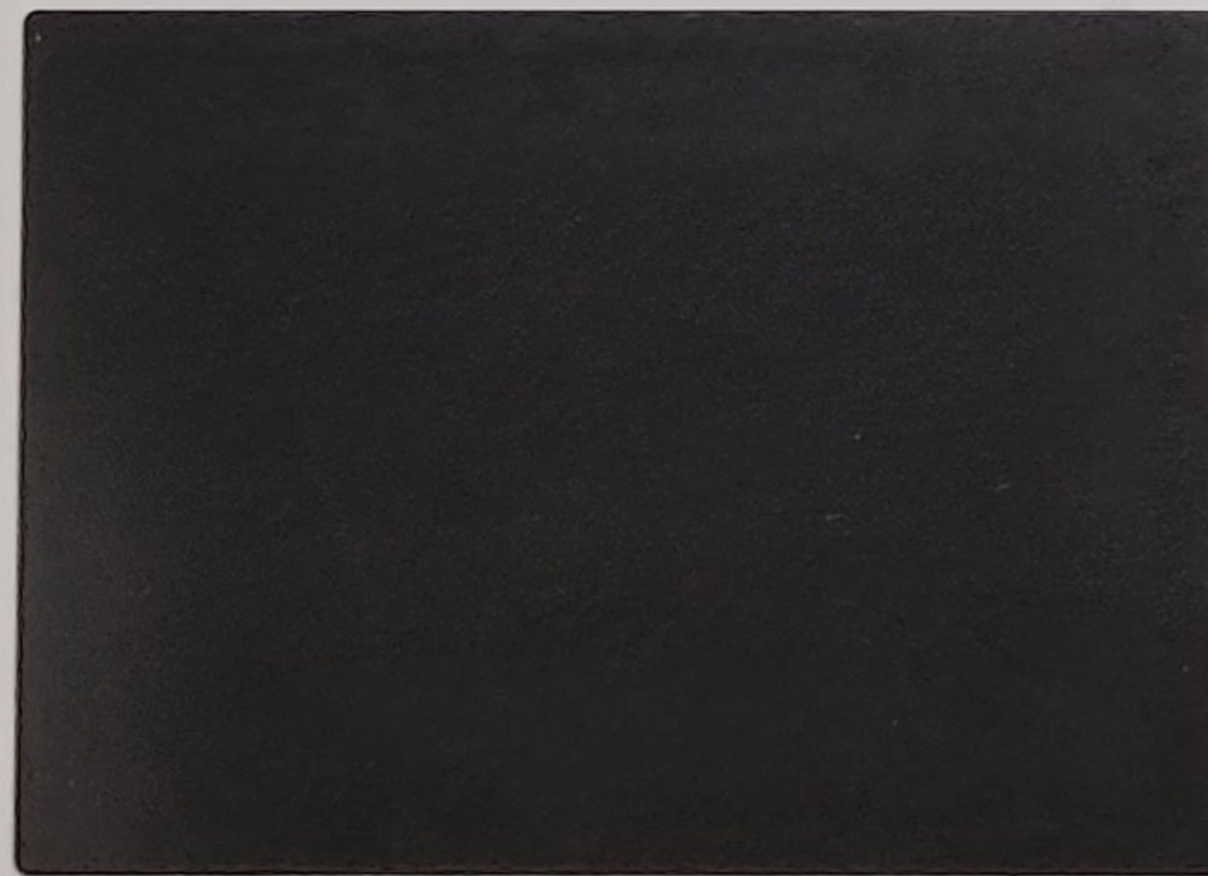
FIBER CEMENT PANEL FCP 2 - Above & Below Windows

PRODUCT: COMMERCIAL-GRADE VPI 'ENDURANCE' FIXED, CASEMENT & PATIO DOORS COLOR: WHITE INTERIOR BODY, FACTORY BLACK FOIL EXTERIOR FINISH