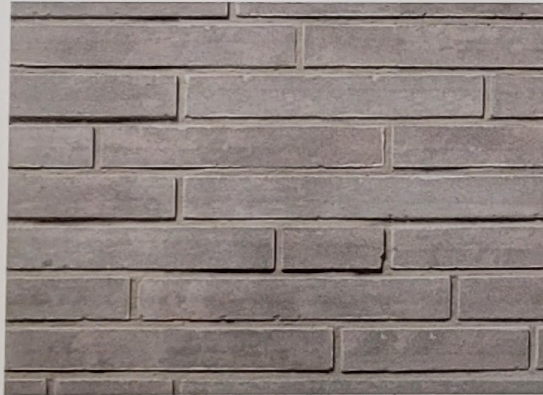
LINEAR BRICK VENEER

PRODUCT: ARRISCRAFT 'ARCHITECTURAL LINEAR' COLOR: CHARCOAL SIZE: 2.25" x 3.75" x 8" - 32" DETAILS: RANDOM SIZES AND BOND, TOOLED BED JOINTS