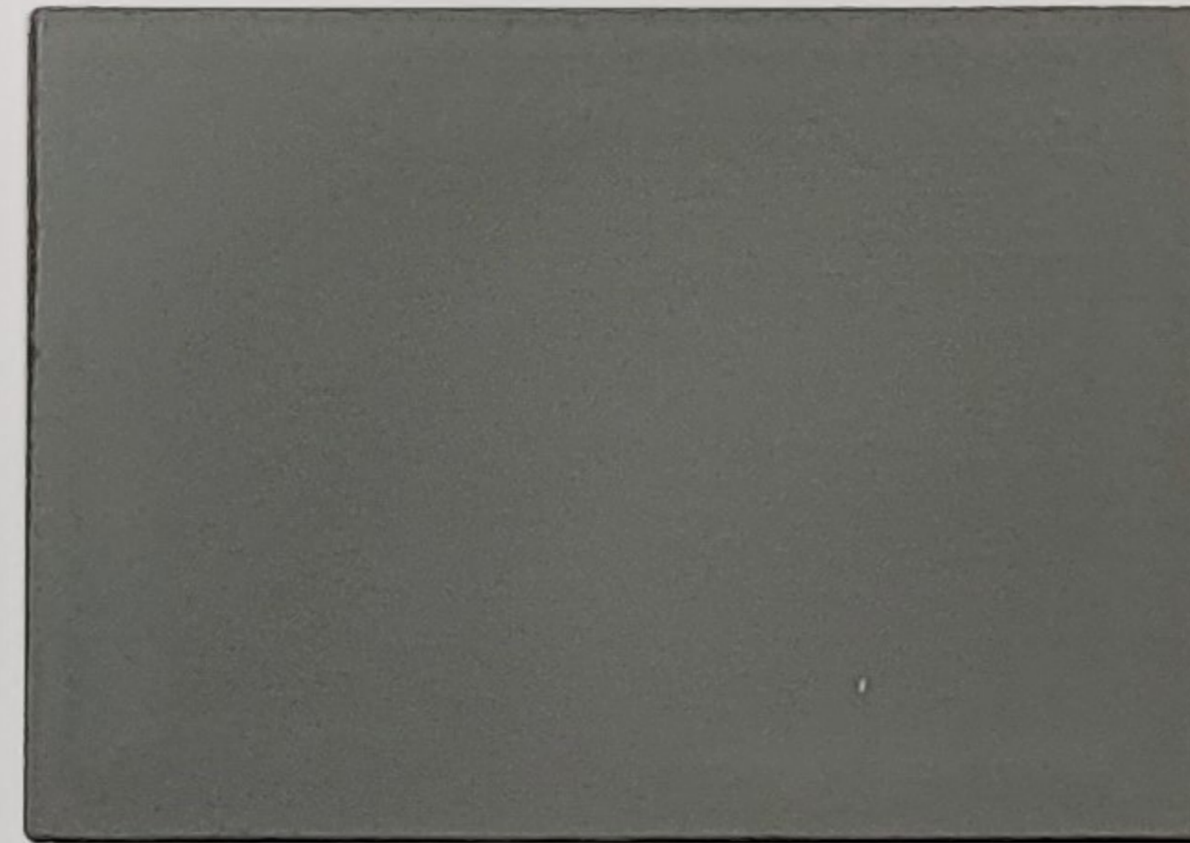
FIBER CEMENT PANEL FCP 1 - Primary Upper Facade

PRODUCT: RESYSTA COLOR: DARK SIAM, 2-COAT FINISH SIZE: DARK SIAM, 2-COAT FINISH DETAILS: VERTICAL ORIENTATION, ALIGNED HORIZONTAL JOINTS AT EACH FLOOR